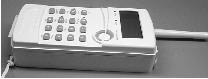
Figure 3: Picture of closed unit.