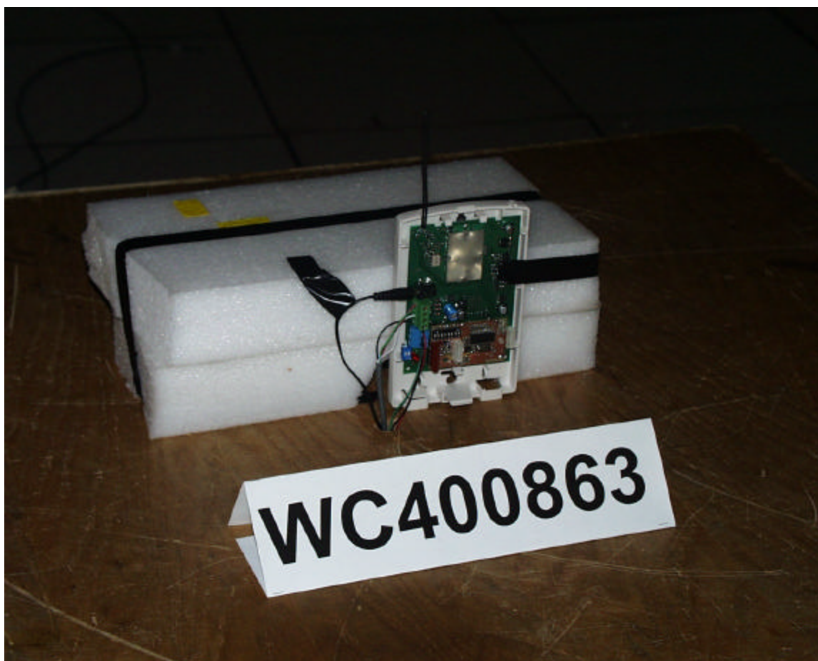
Figure 1: Picture of DUT on test table, showing daughterboard connected and bus wires for each of the security panels connected.