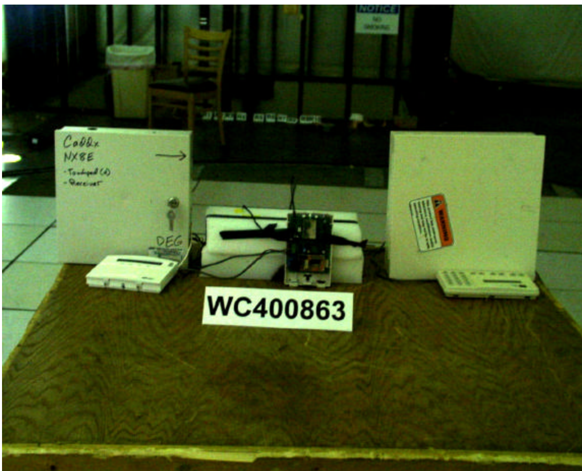
Figure 2: Picture of DUT on test table, along with security systems attached.