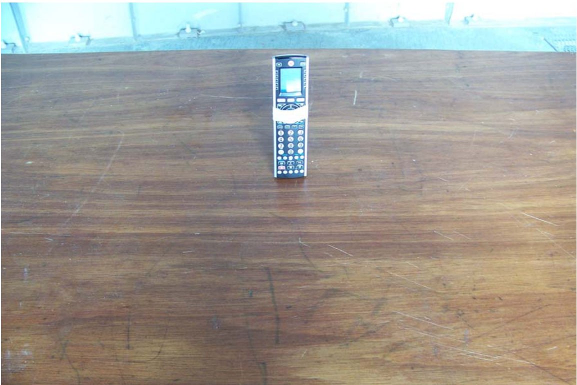
Radiated Emissions, Fundamental and Harmonics, Y Axis