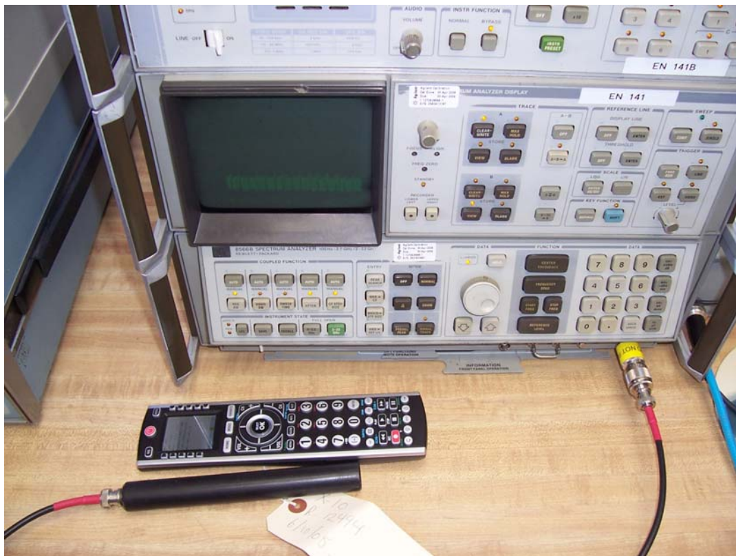
Duty Cycle Determination