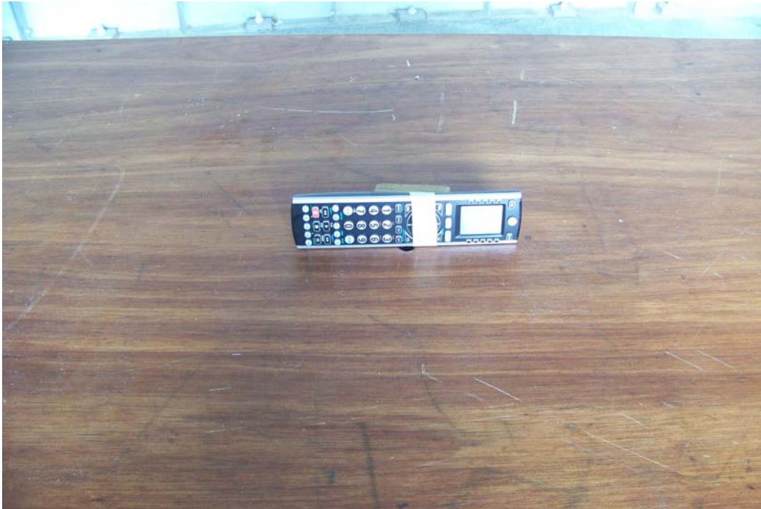
Radiated Emissions, Fundamental and Harmonics, Z Axis