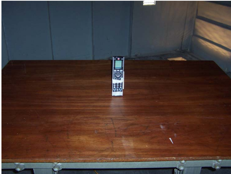
Fundamental, Harmonics and Spurious Case, Z-Axis