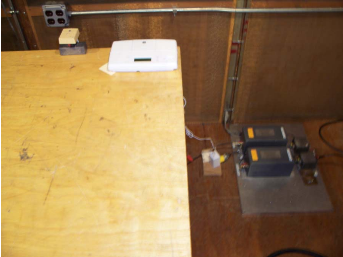
Conducted Emissions Front View