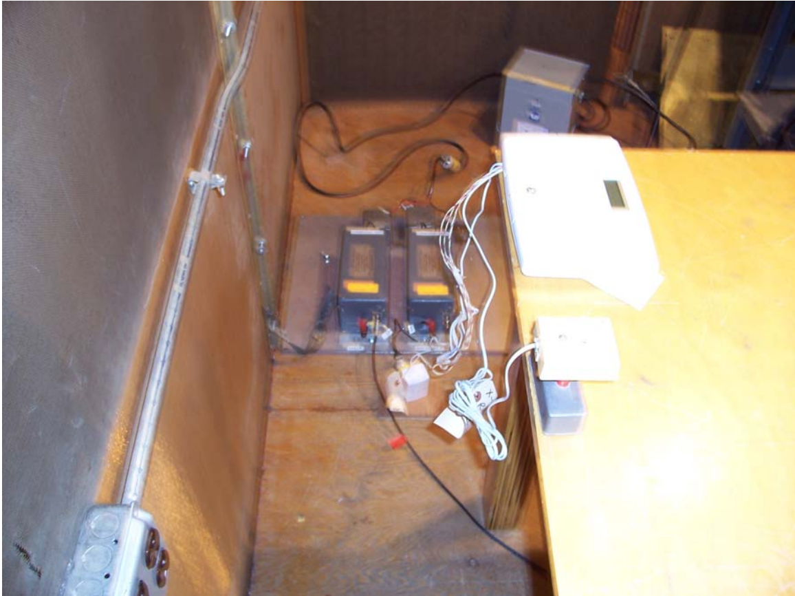
Conducted Emissions Back View