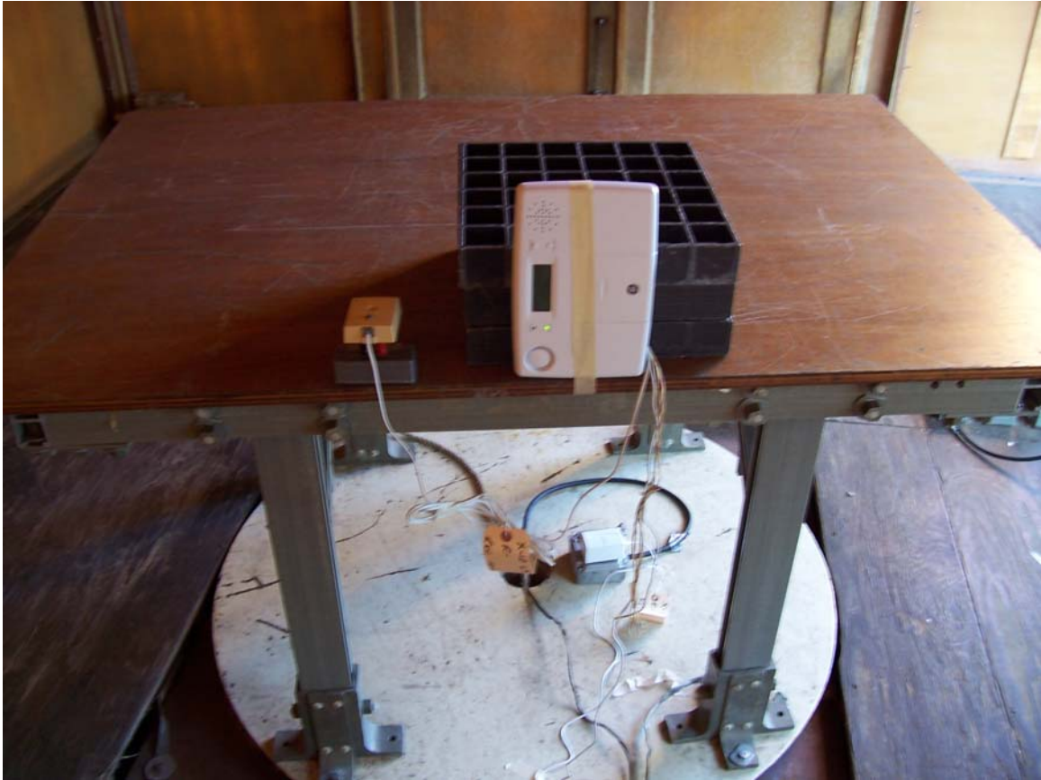
Radiated Emissions Z-Axis