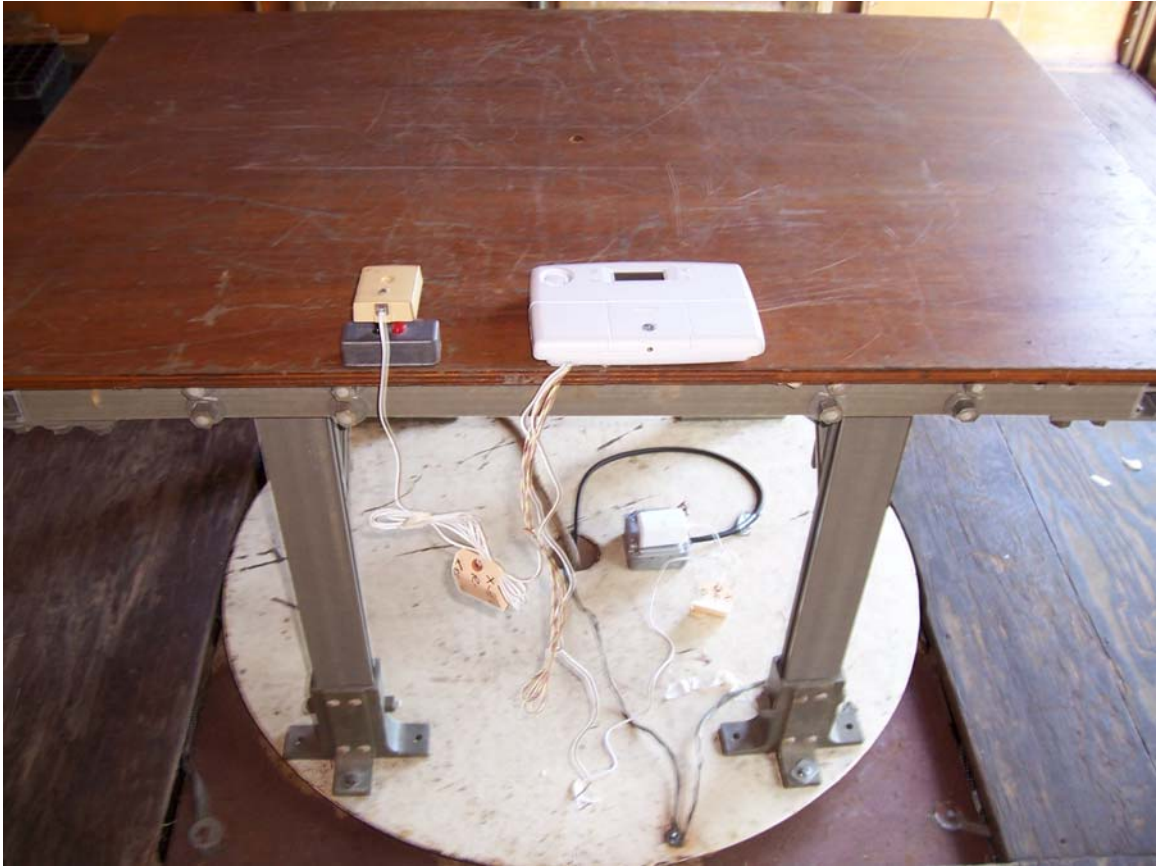
Radiated Emissions X-Axis