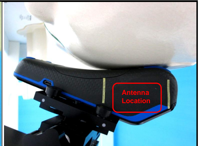
Rear Face of EUT with 0 cm Gap (Verified Testing on Curved Phantom)