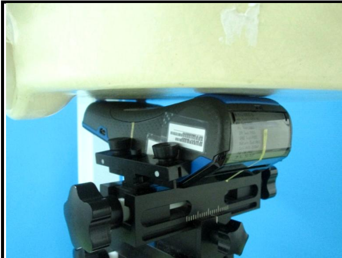
Rear Face of EUT with 0 cm Gap (Formal Testing on Flat Phantom)