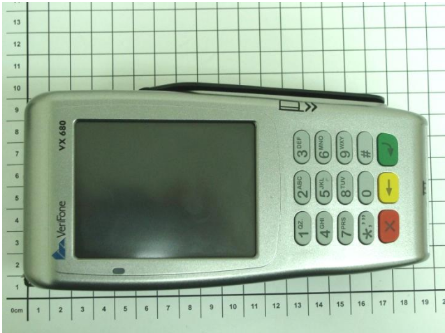
DUT – Front View