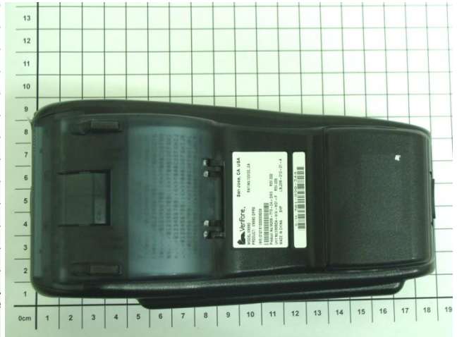
DUT – Rear View