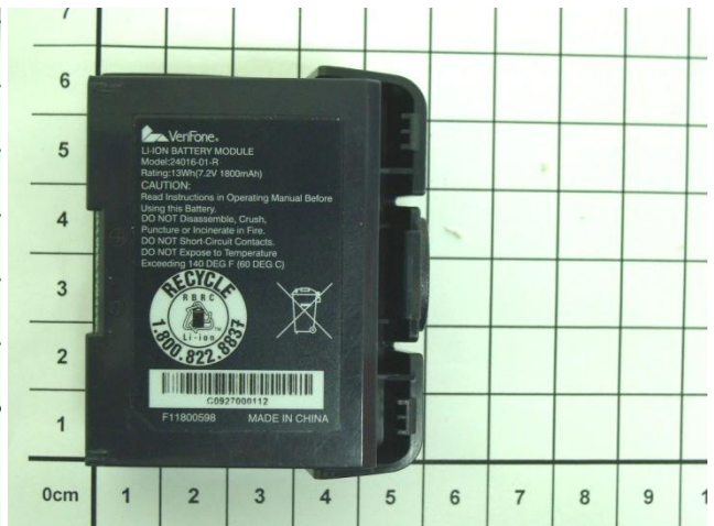
Battery 2 – Rear View