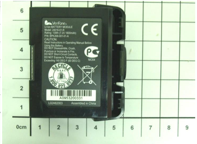
Battery 1 – Rear View