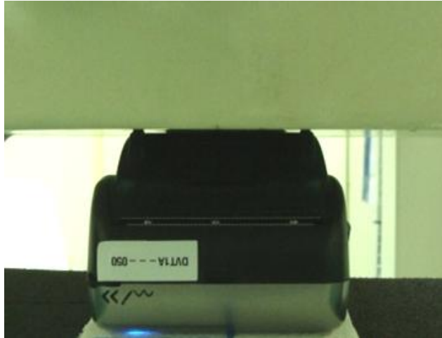
Bottom of the DUT with Phantom 0 cm Gap