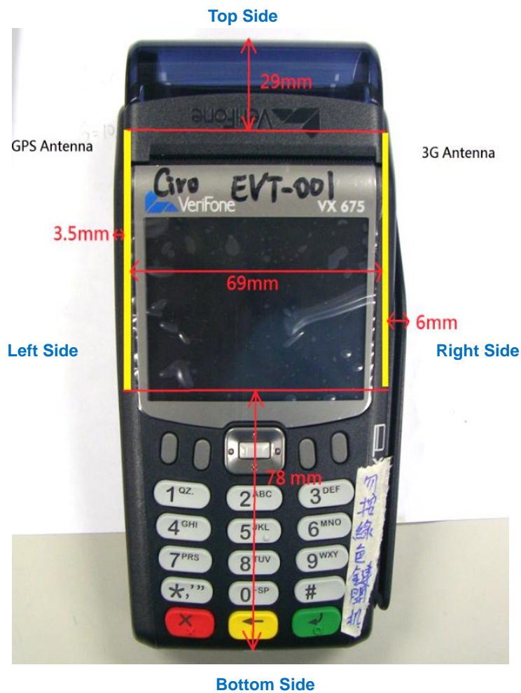
<EUT Front View>