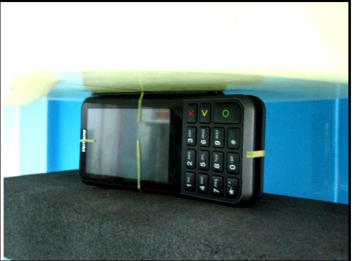
Right Side of EUT with 0 cm Gap