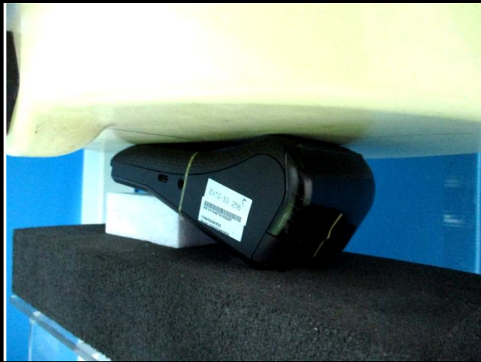
Rear Face of EUT with 0 cm Gap