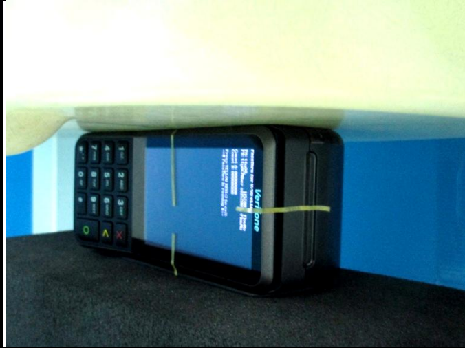
Left Side of EUT with 0 cm Gap