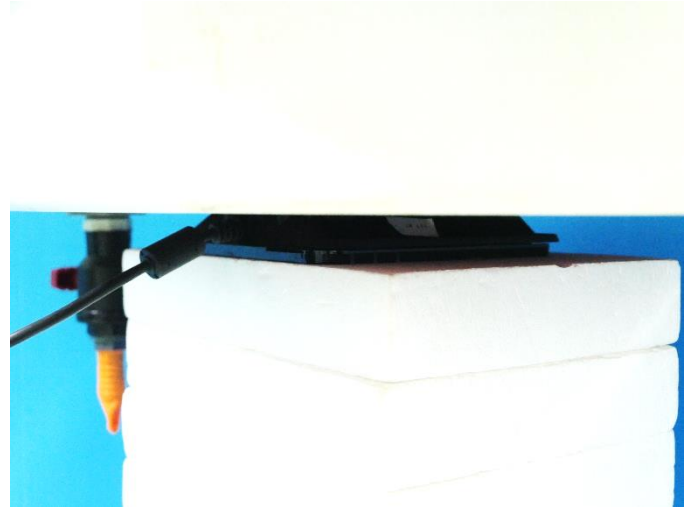
Fig-4.2 Rear Face of EUT with 0 mm Gap