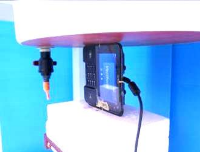
Fig-4.3 Left Side of EUT with 0 mm Gap