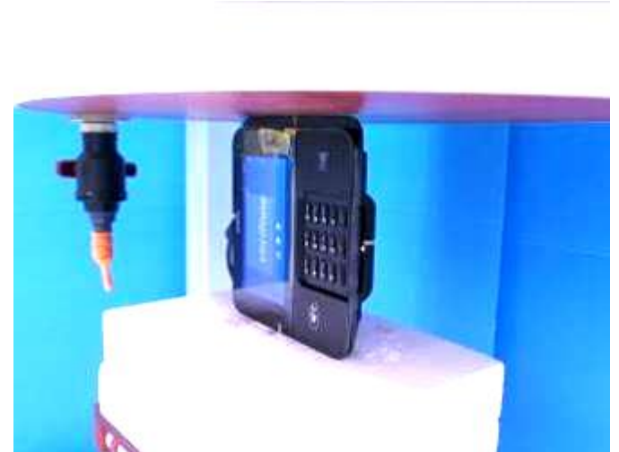
Fig-4.4 Right Side of EUT with 0 mm Gap