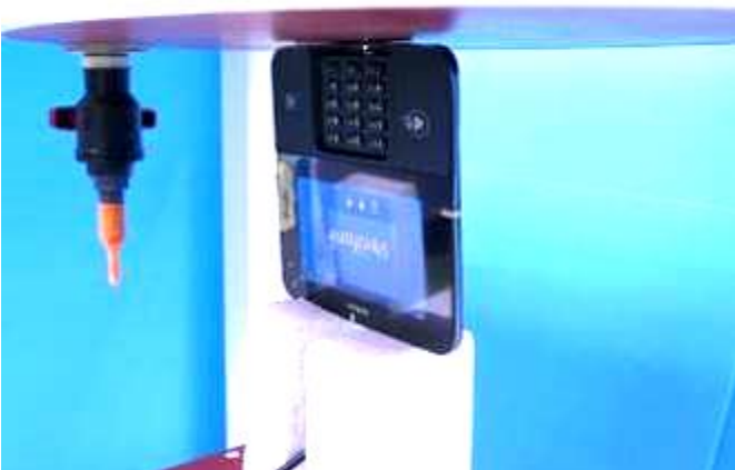
Fig-4.5 Bottom Side of EUT with 0 mm Gap