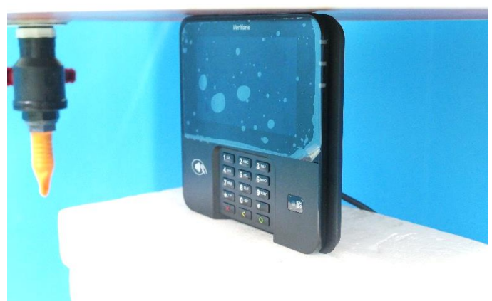
Fig-4.6 Top Side of EUT with 0 mm Gap