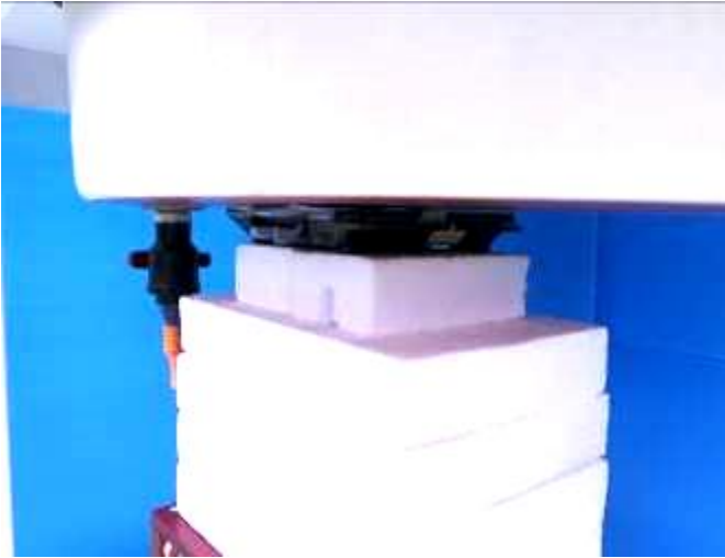
Fig-4.1 Front Face of EUT with 0 mm Gap