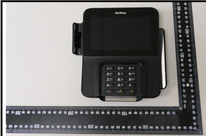
Front Face of EUT