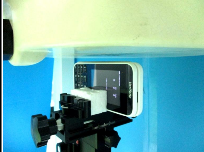
Body - Left Side of EUT at 10 mm