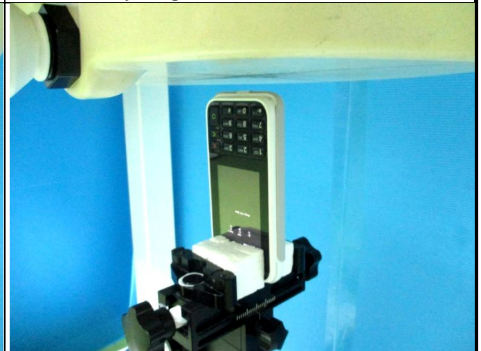
Body - Bottom Side of EUT at 10 mm