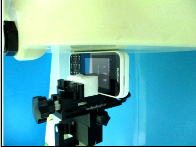
Limb - Left Side of EUT at 0 mm