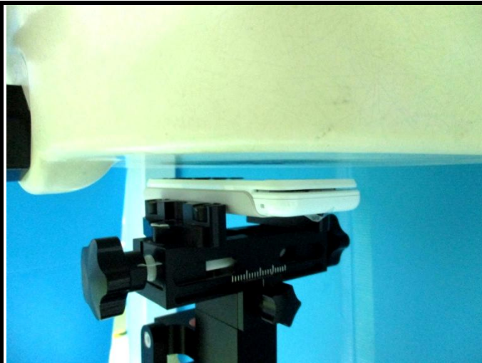
Body - Front Face of EUT at 10 mm