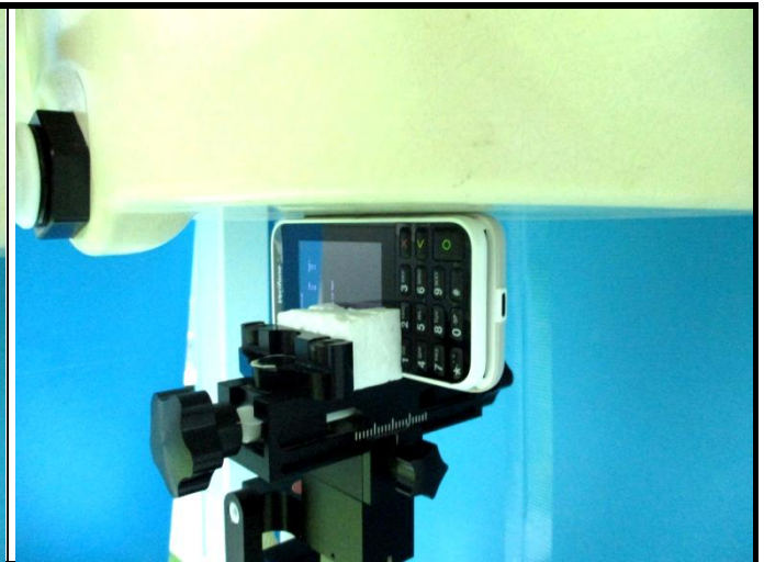
Limb - Right Side of EUT at 0 mm