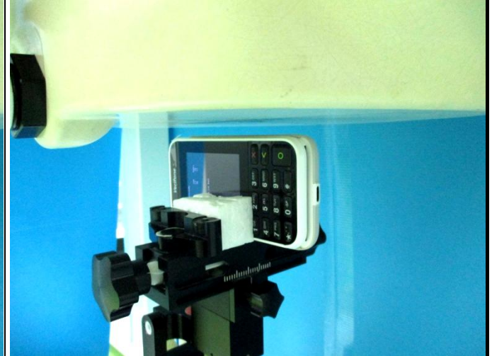
Body - Right Side of EUT at 10 mm