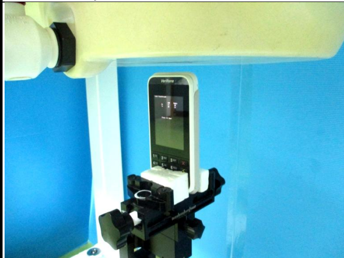
Body - Top Side of EUT at 10 mm