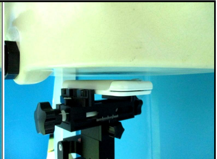
Body - Rear Face of EUT at 10 mm