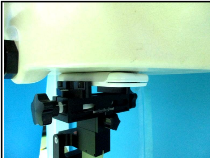
Limb - Rear Face of EUT at 0 mm