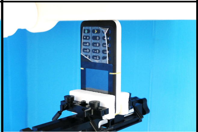
Bottom Side of EUT Tested at 0 mm