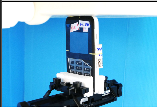
Top Side of EUT Tested at 0 mm