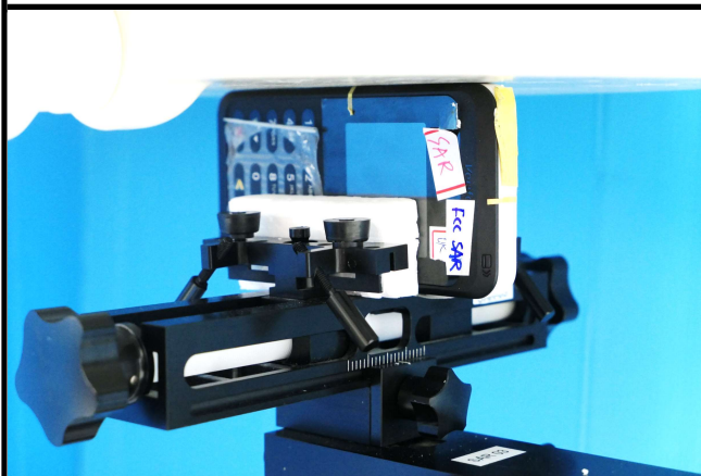
Left Side of EUT Tested at 0 mm