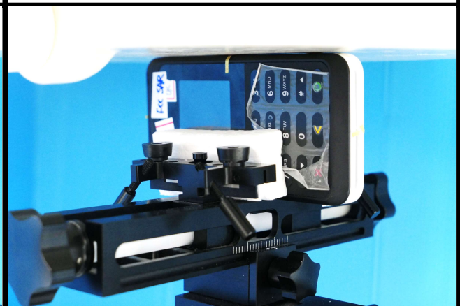
Right Side of EUT Tested at 0 mm