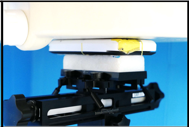
Rear Face of EUT Tested at 0 mm