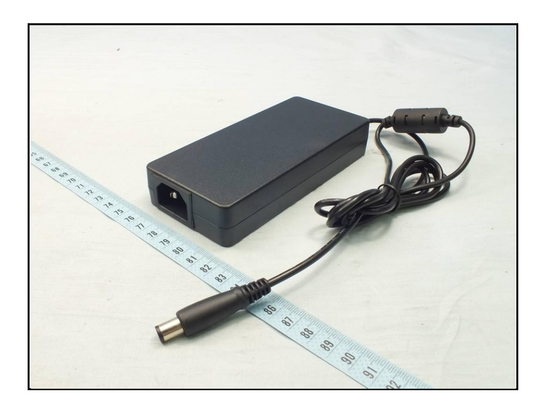
Page 3 of 13