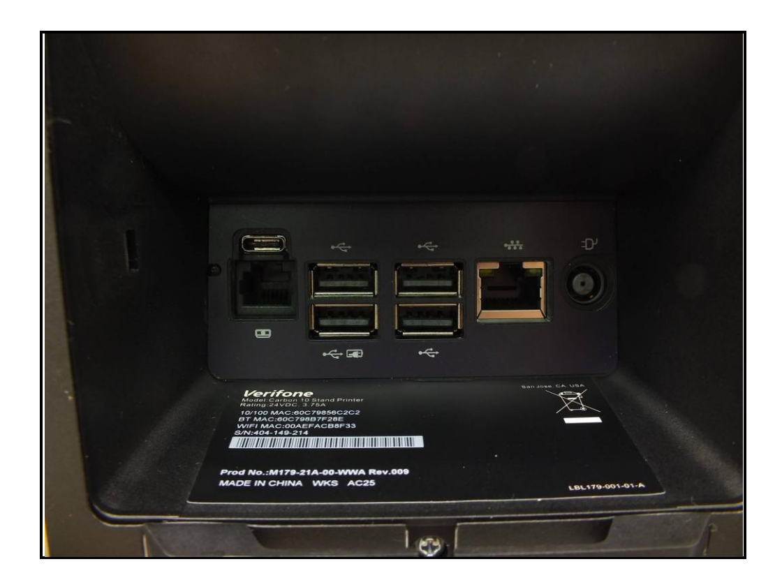
Page 2 of 13