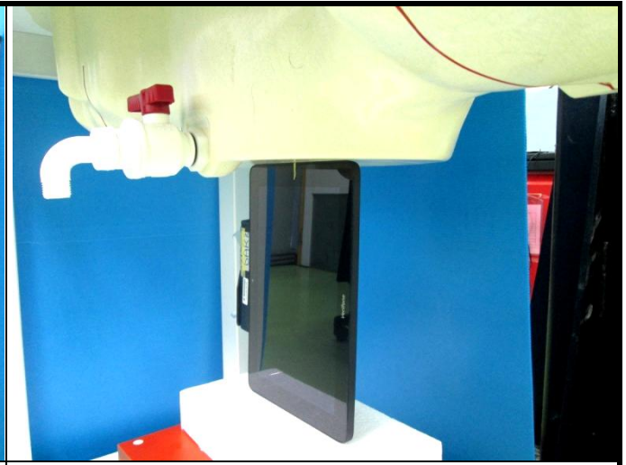
Right Side of EUT with 0 cm Gap