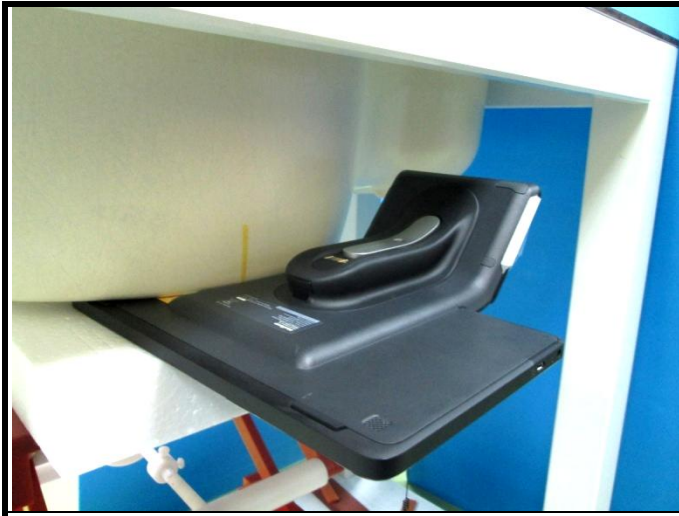
Rear Face of EUT with 0 cm Gap