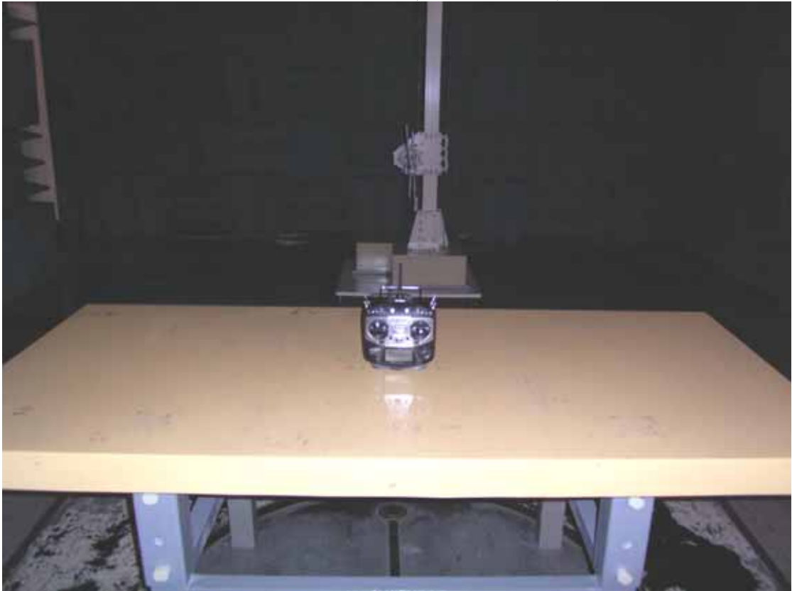
Test Mode: Transmit and Receiver (Position: Stand)