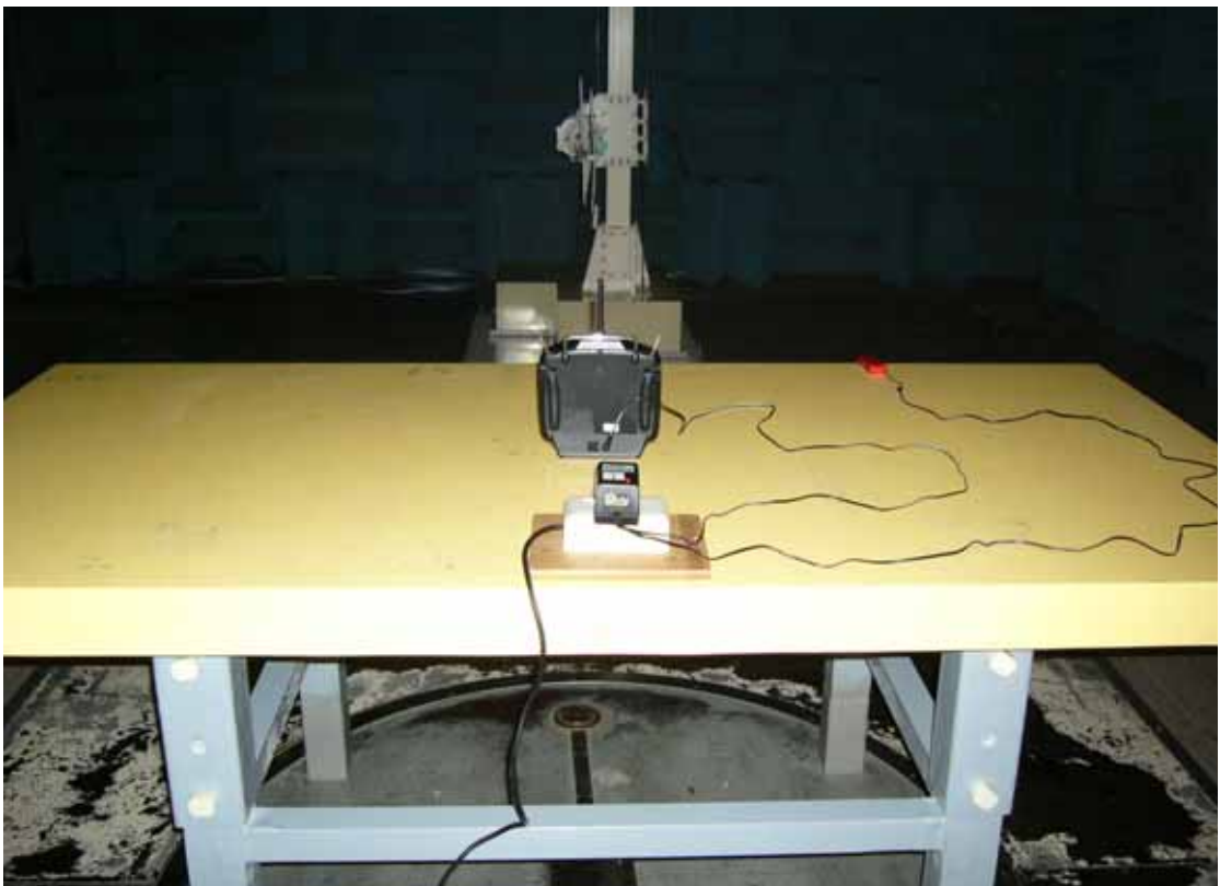
BACK VIEW OF RADIATED MEASUREMENT