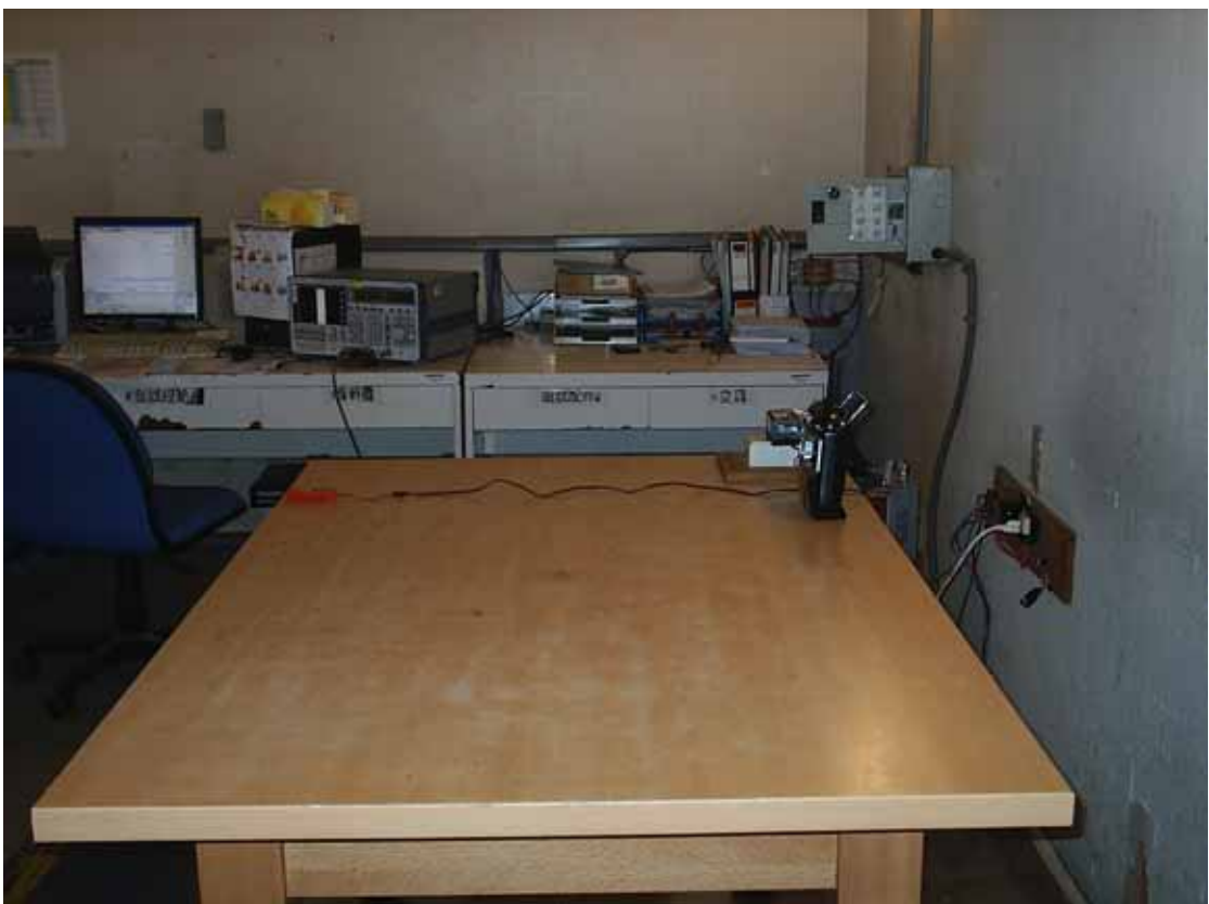
BACK VIEW OF CONDUCTED MEASUREMENT