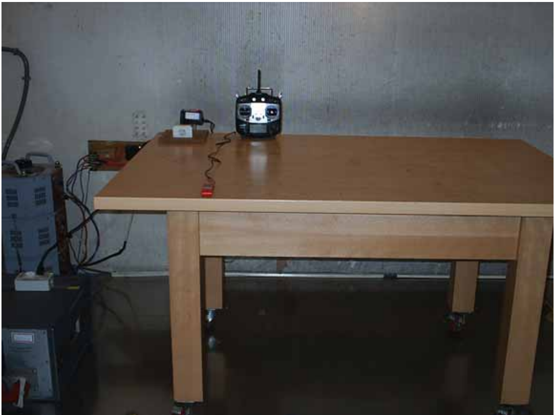
FRONT VIEW OF CONDUCTED MEASUREMENT