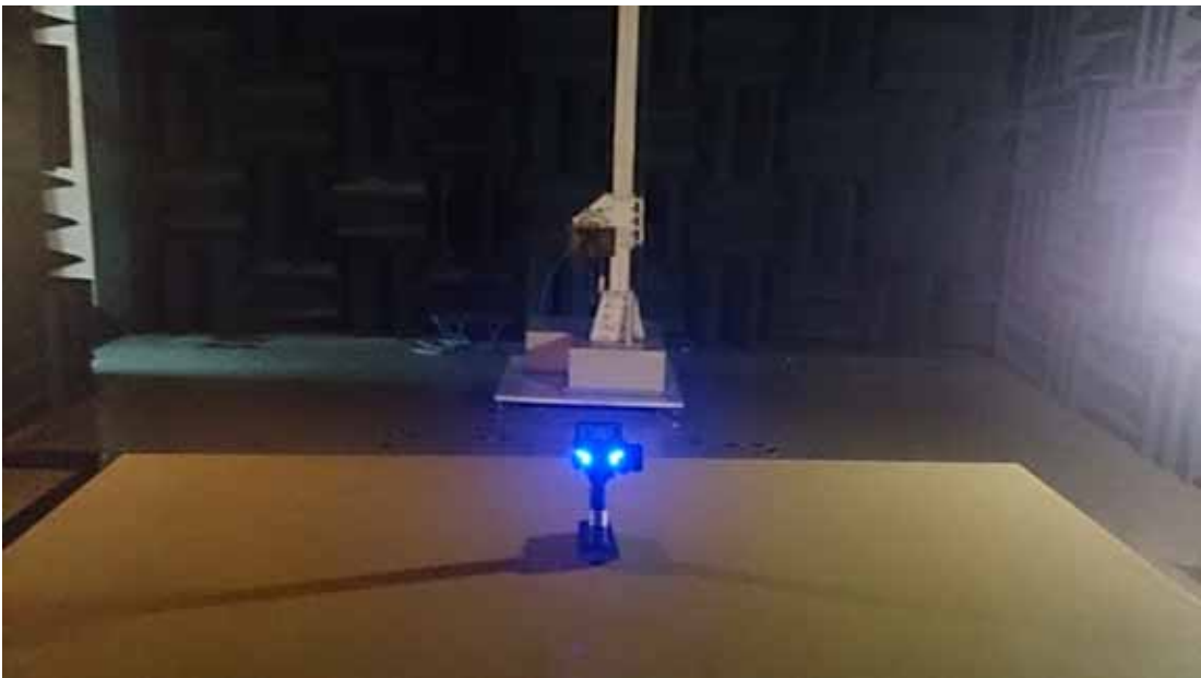
Test Position: Stand