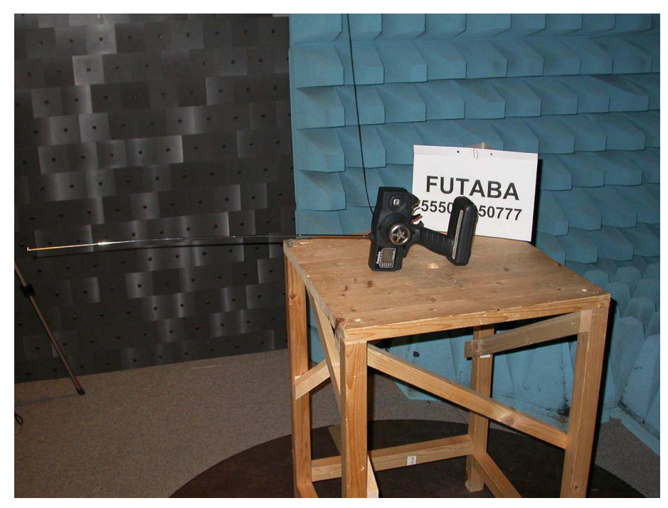
Figure 3: EUT on left side