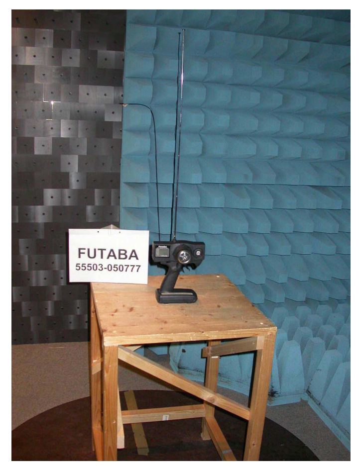
Figure 1: EUT in upright position