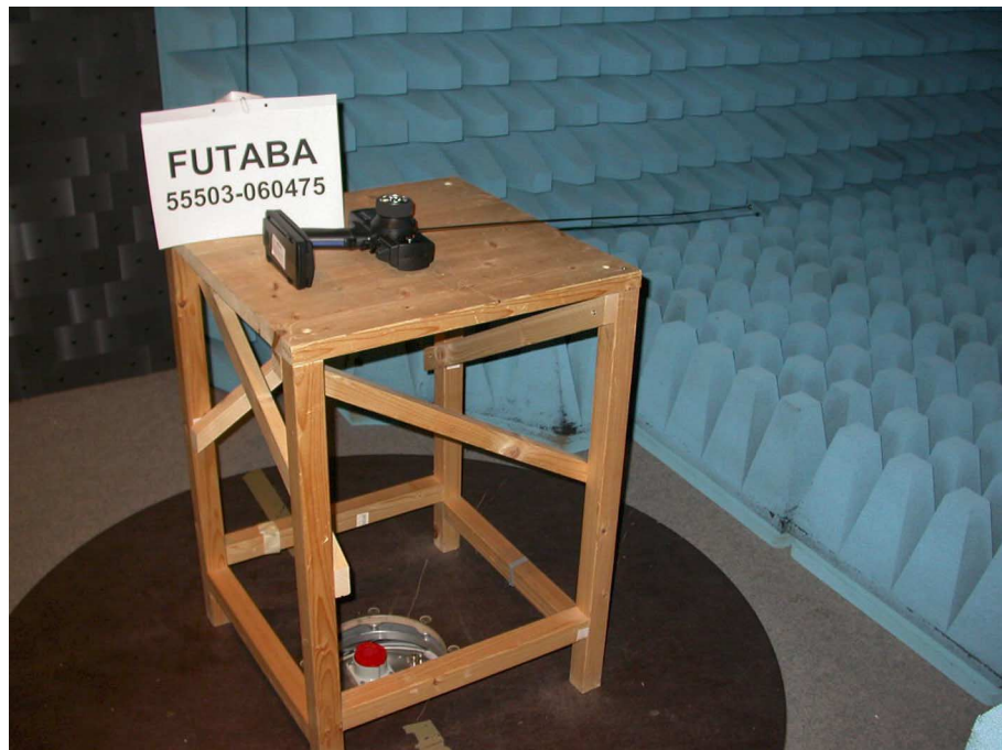
Figure 2: EUT on rear side