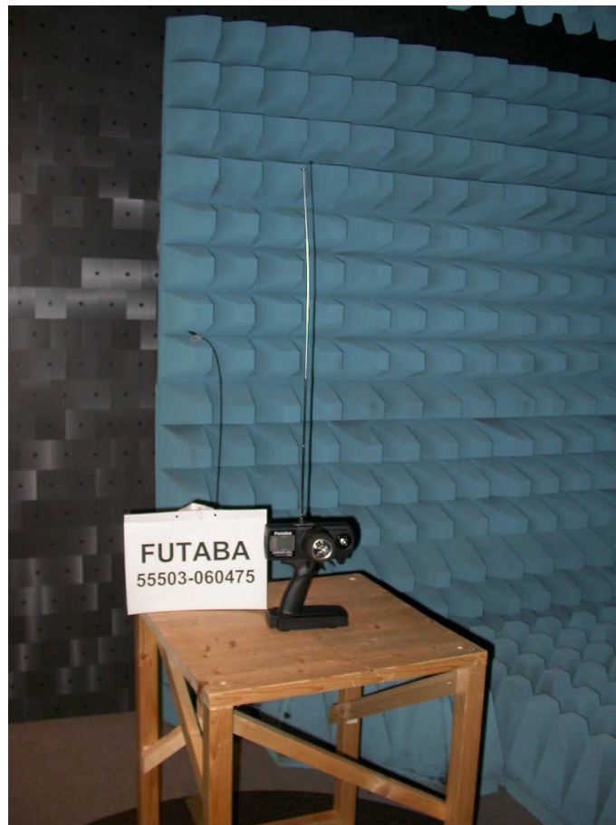
Figure 1: EUT in upright position