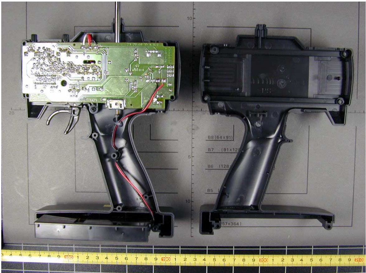
Top view of disassembled EUT