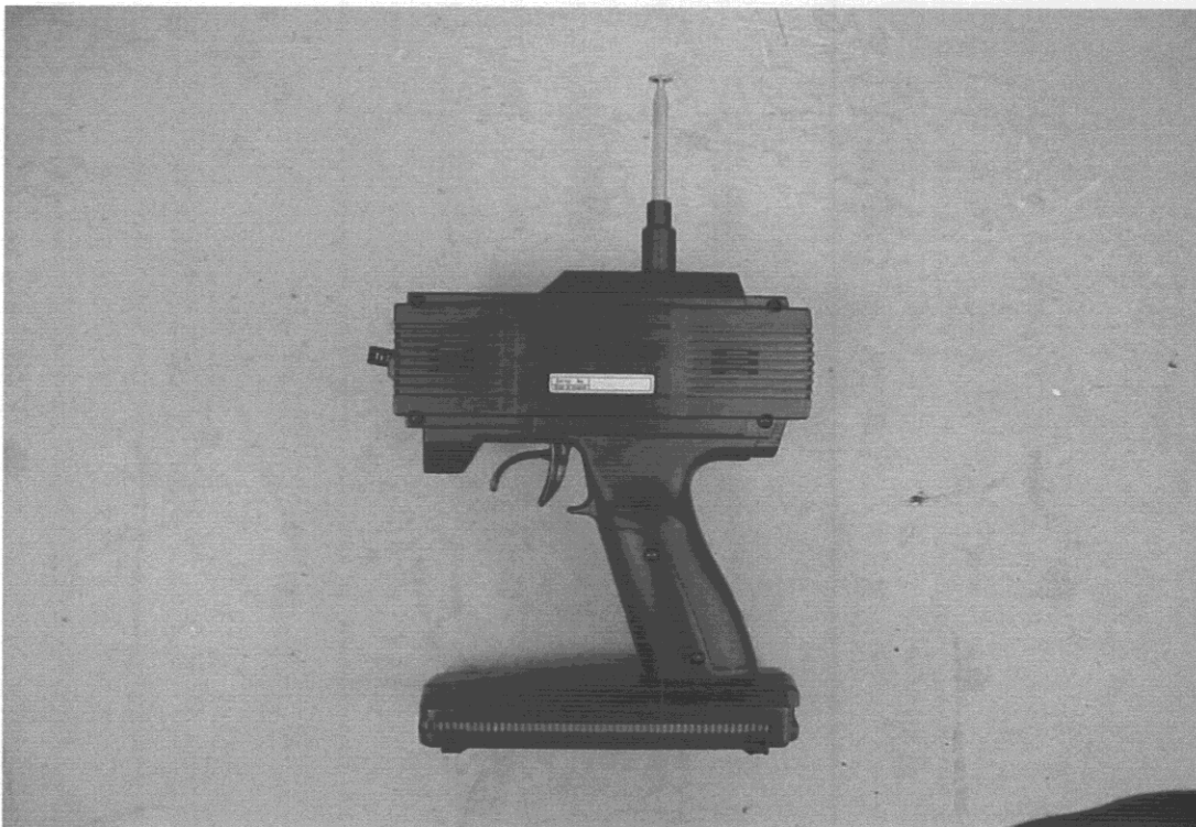
6.4 EUT Construction View 2