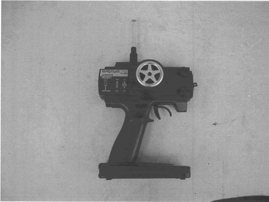
6.3 EUT Construction View 1