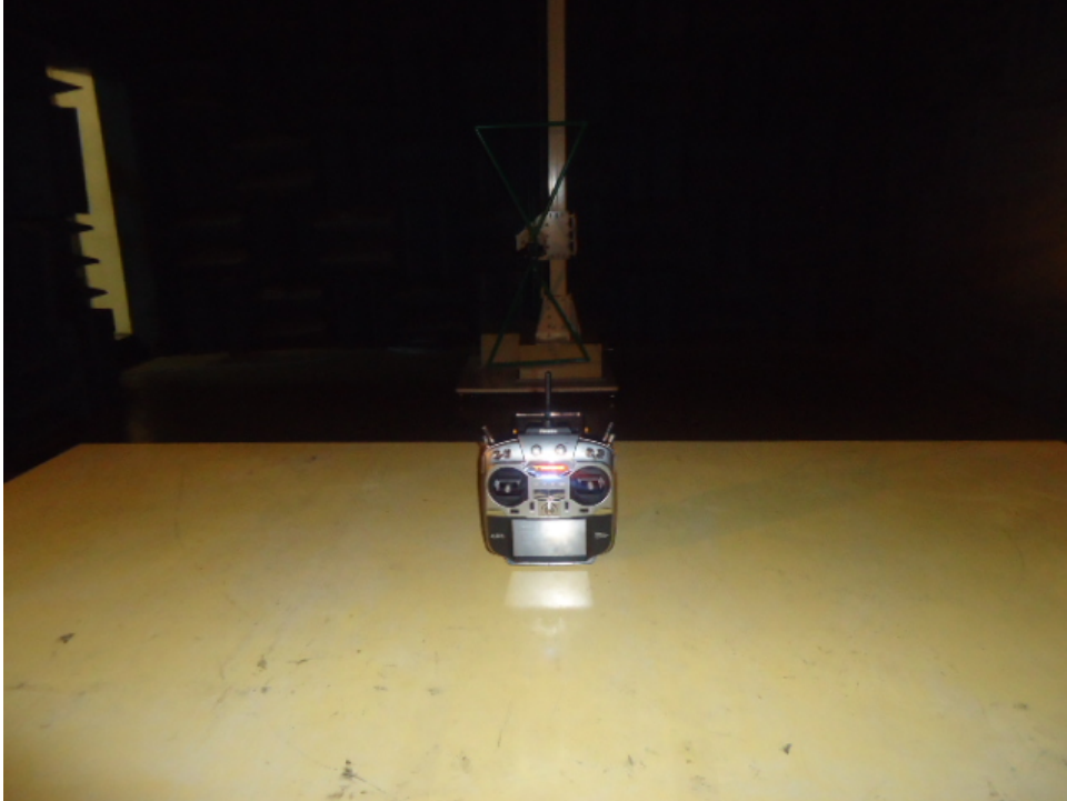
Frequency Above 1GHz