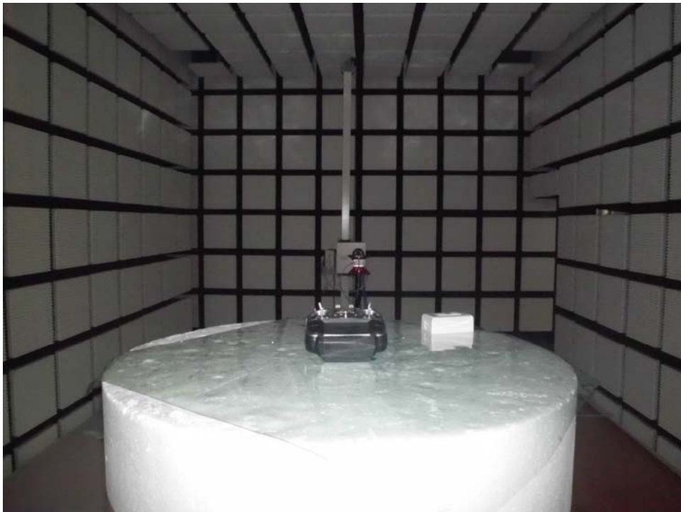
EUT on Lie