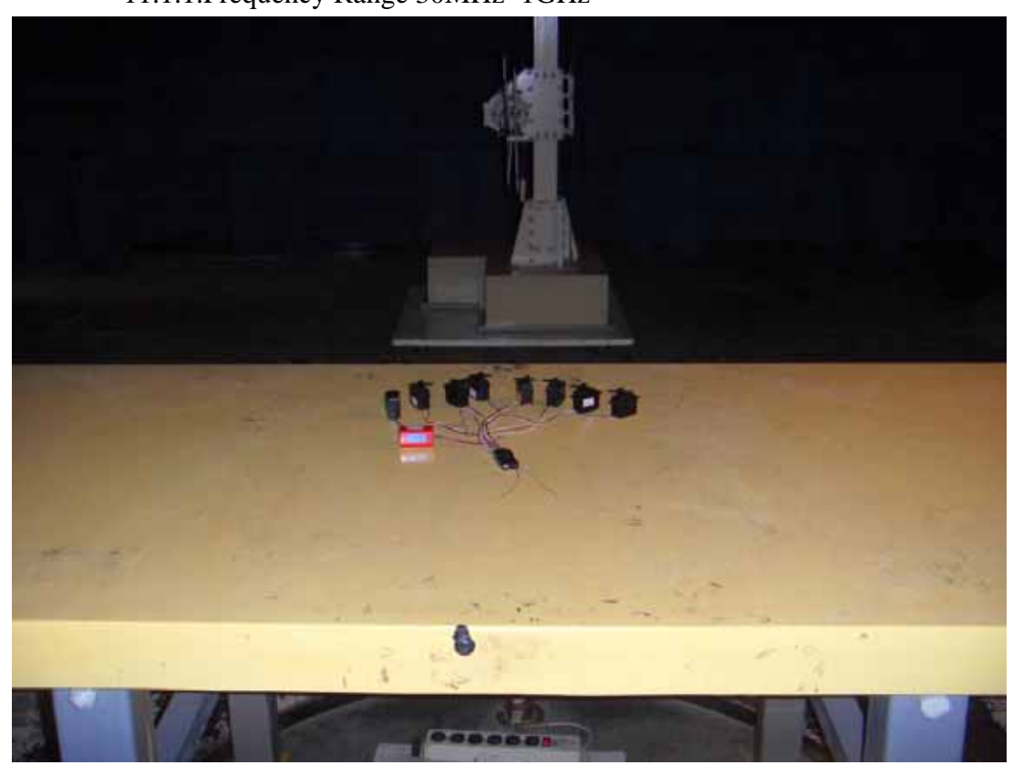
11.1.2.Frequency Range Above 1GHz

11.1.Photos of Radiated Measurement at Semi-Anechoic Chamber 11.1.1.Frequency Range 30MHz~1GHz