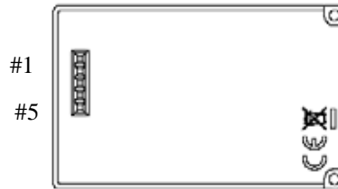
Fig.1 Serial Communication Connector Location