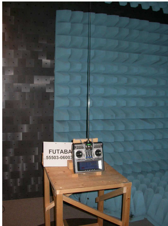
Figure 1: EUT in upright position