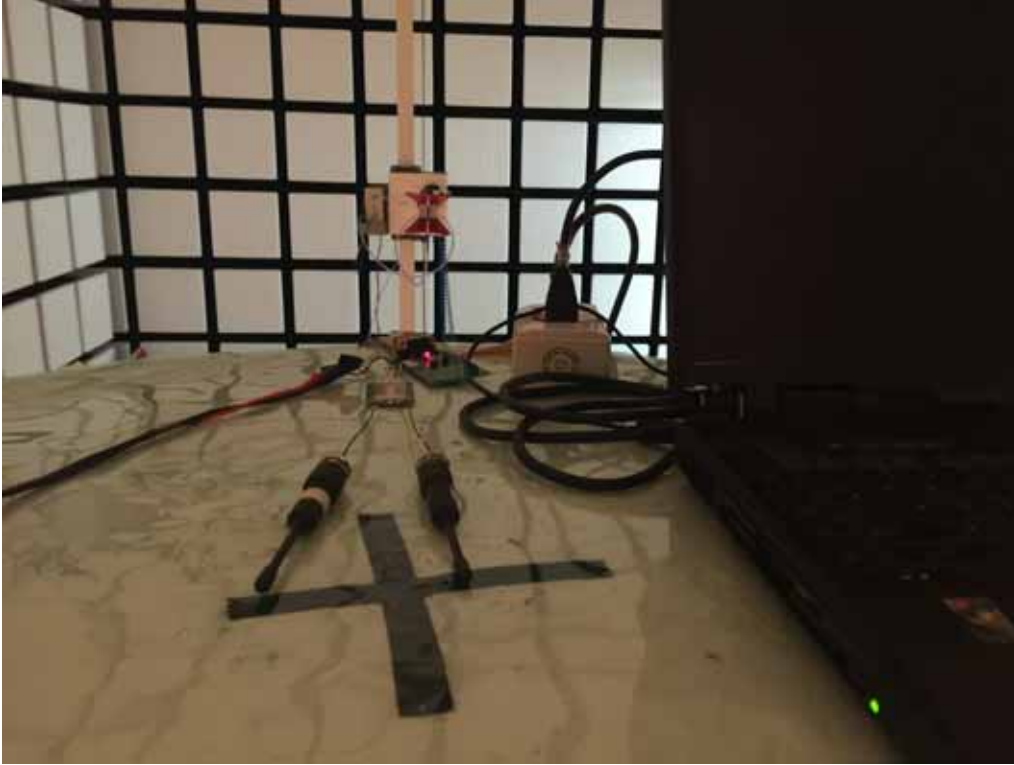
Test With ANT M/N: ANT-2.4-CW-RH