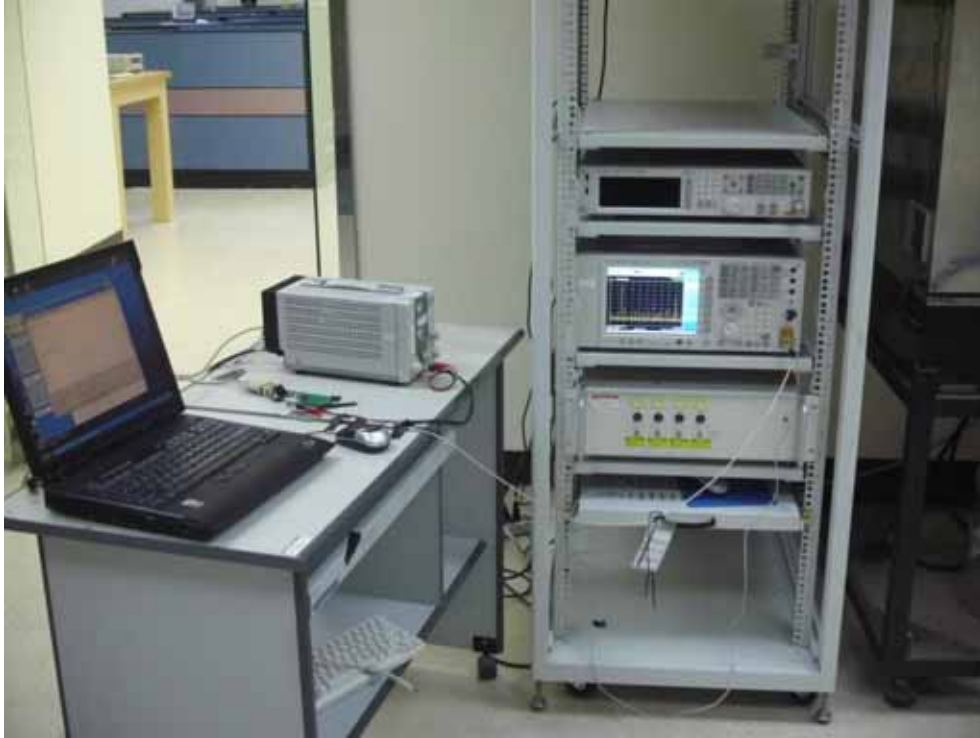
EUT Zoom-in View