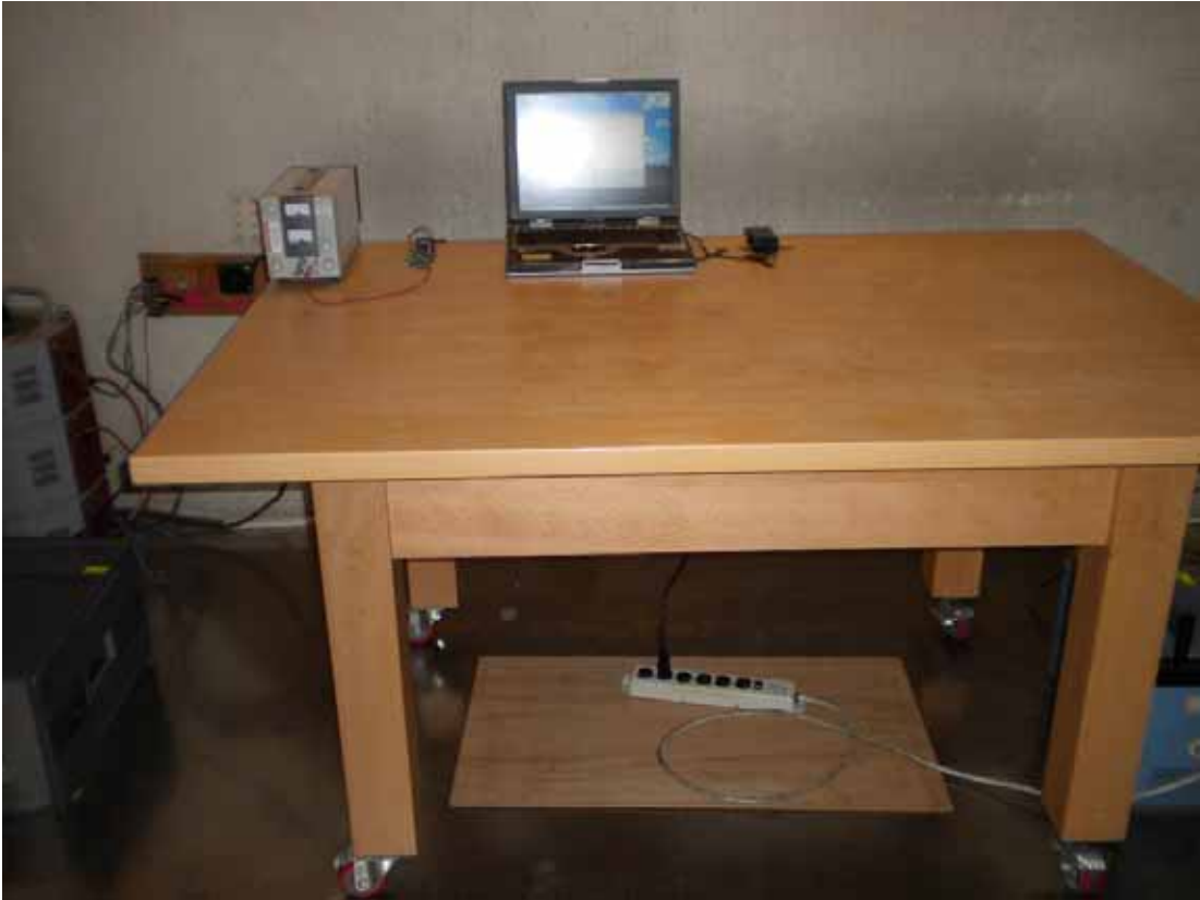
FRONT VIEW OF CONDUCTED MEASUREMENT