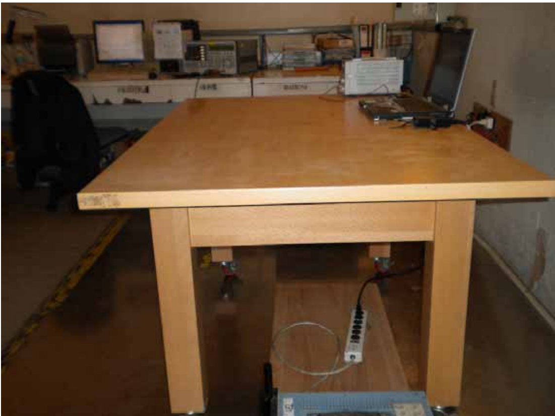
BACK VIEW OF CONDUCTED MEASUREMENT