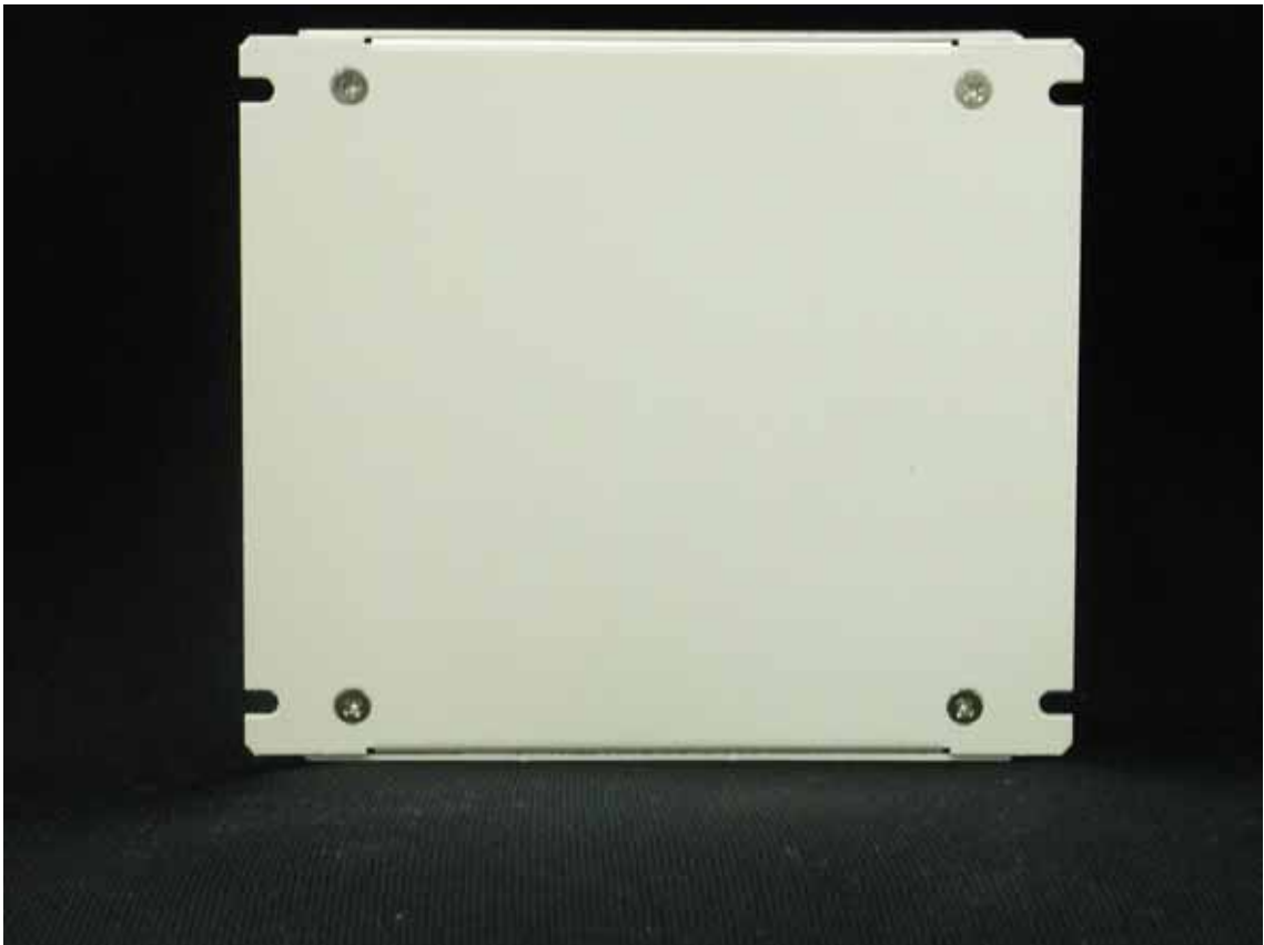
External Photo 3 Model FDK01TU