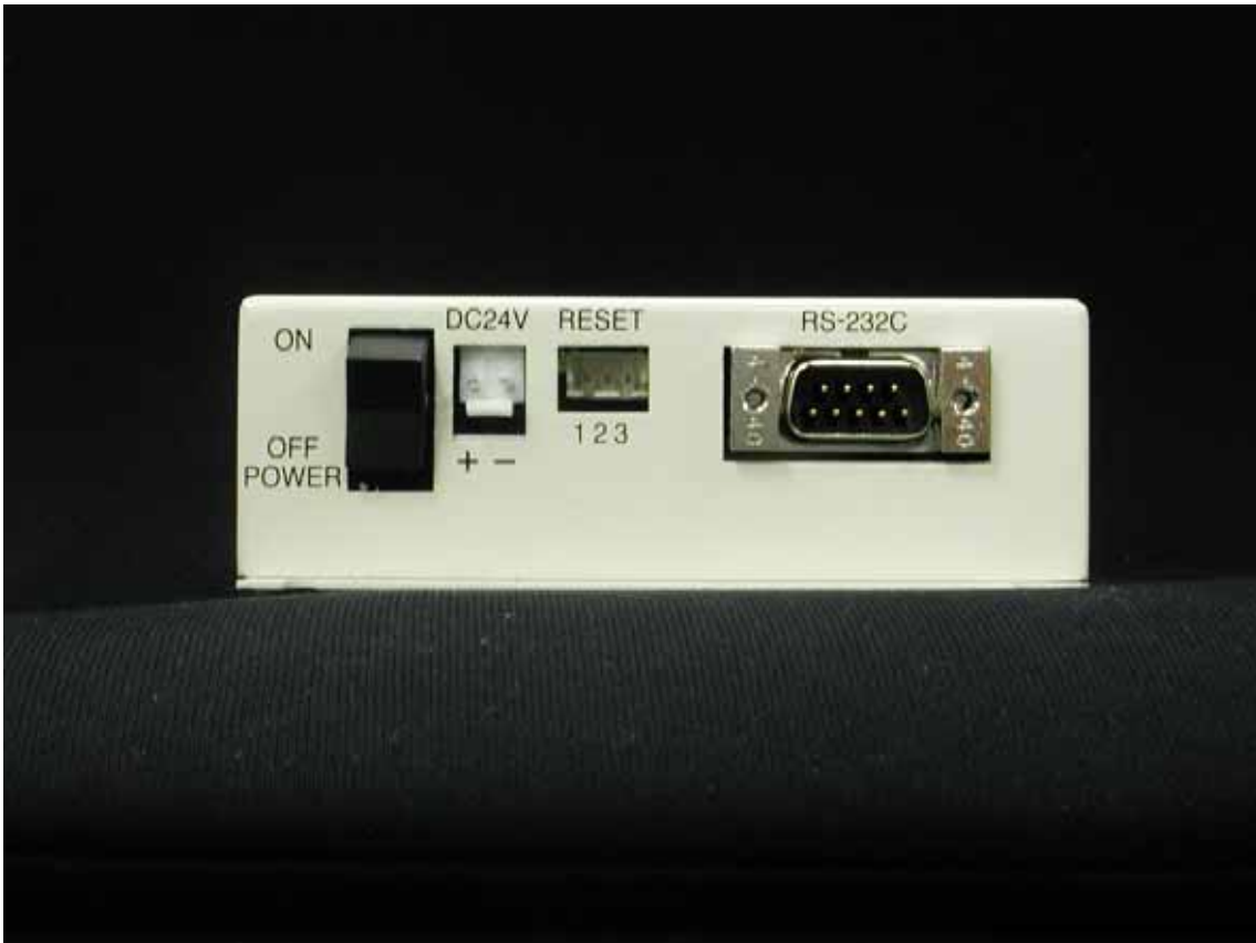
External Photo 1 Model FDK01TU