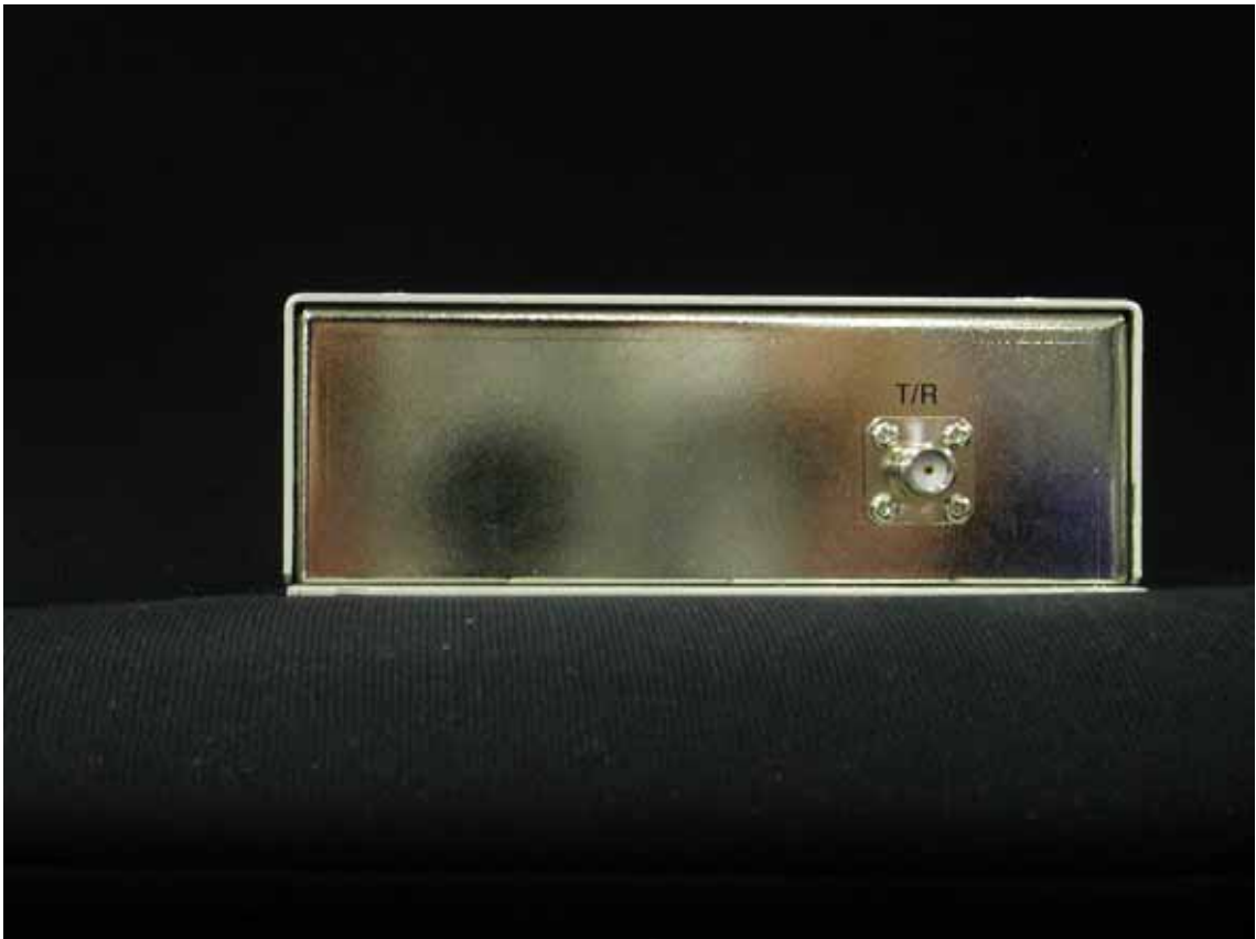
External Photo 2 Model FDK01TU