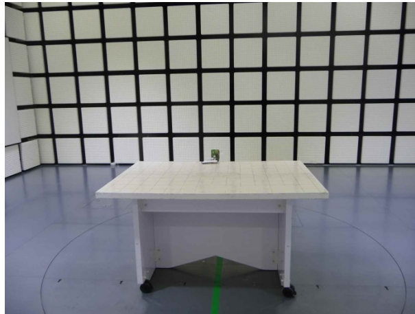
Rear (below 1 GHz)