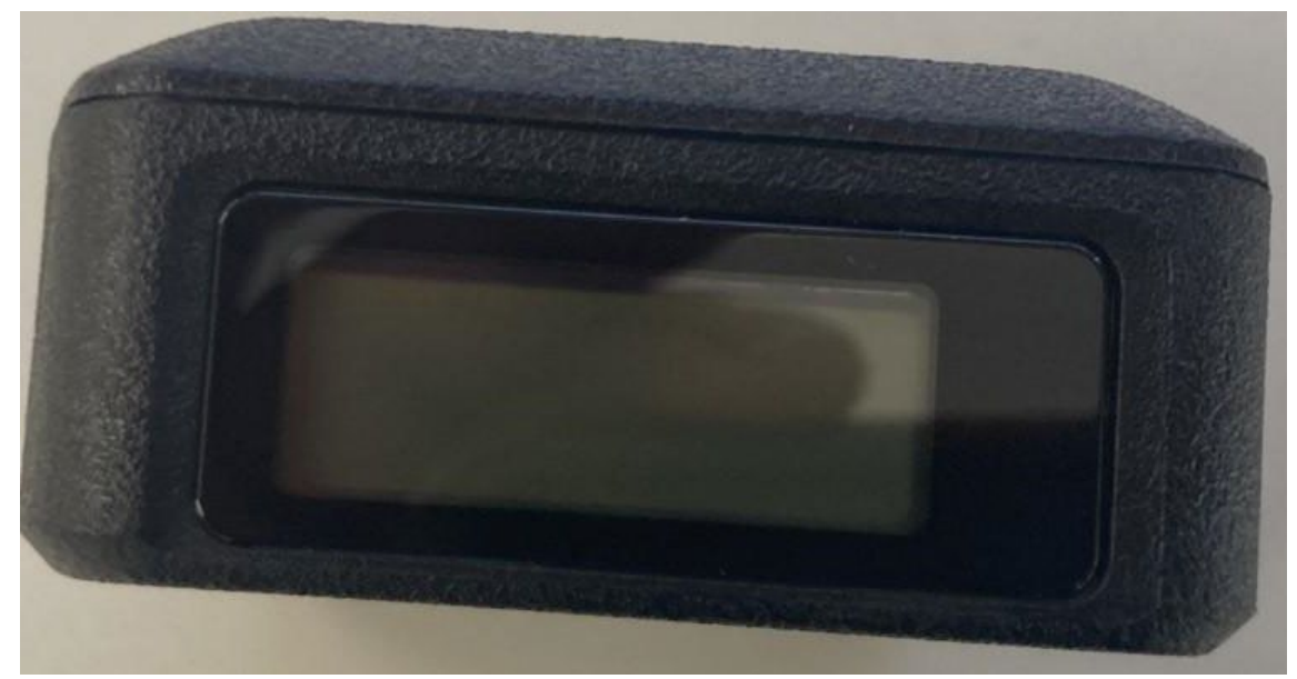
WGA00725, WGA00735, WGA00745, WGA00755, WGA00825, WGA00925, WGA0102