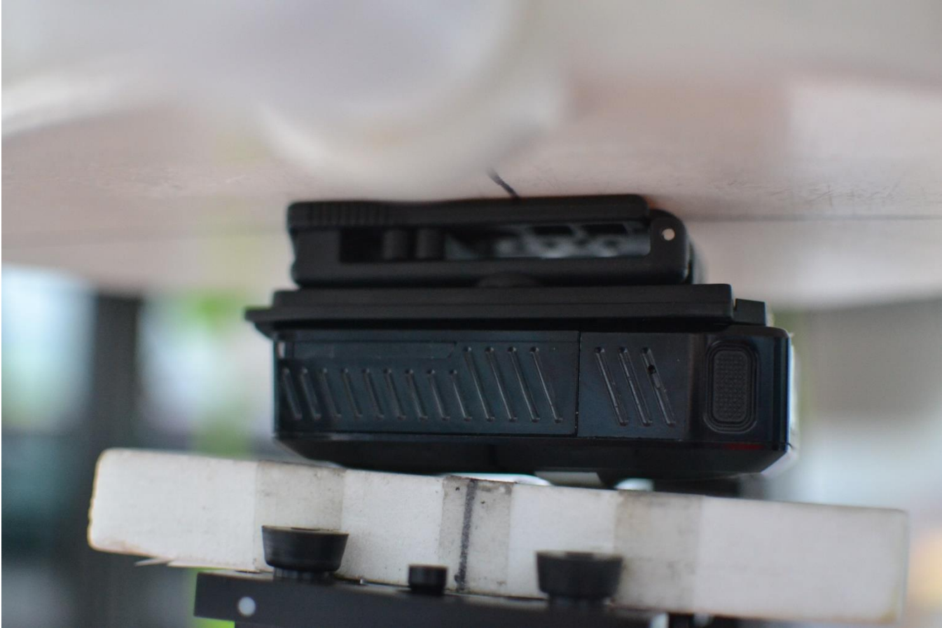
SAR Test Setup Photo 4 – Mount WGA00669, Back Side at 0mm