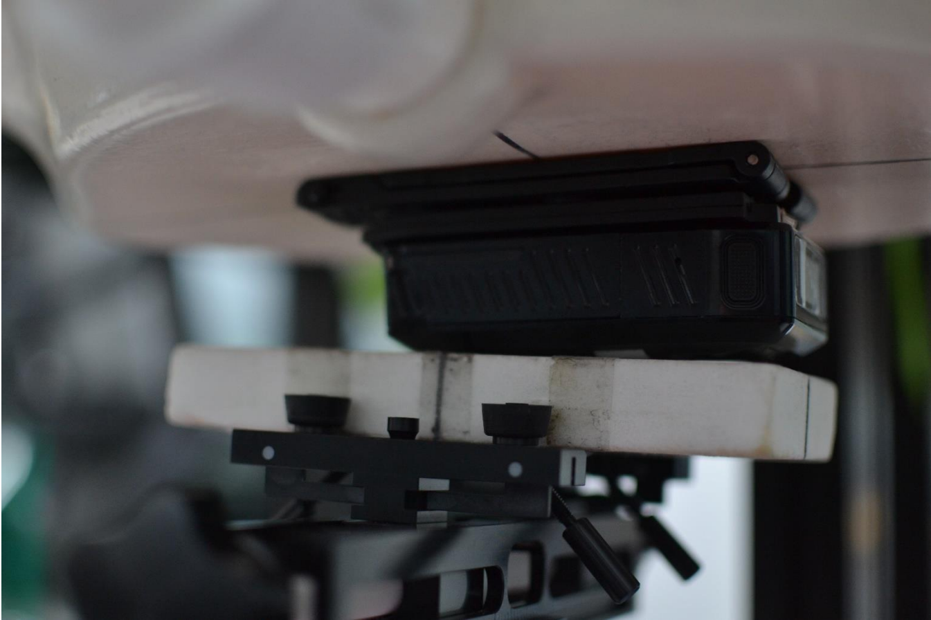
SAR Test Setup Photo 3 – Mount WGA00668, Back Side at 0mm