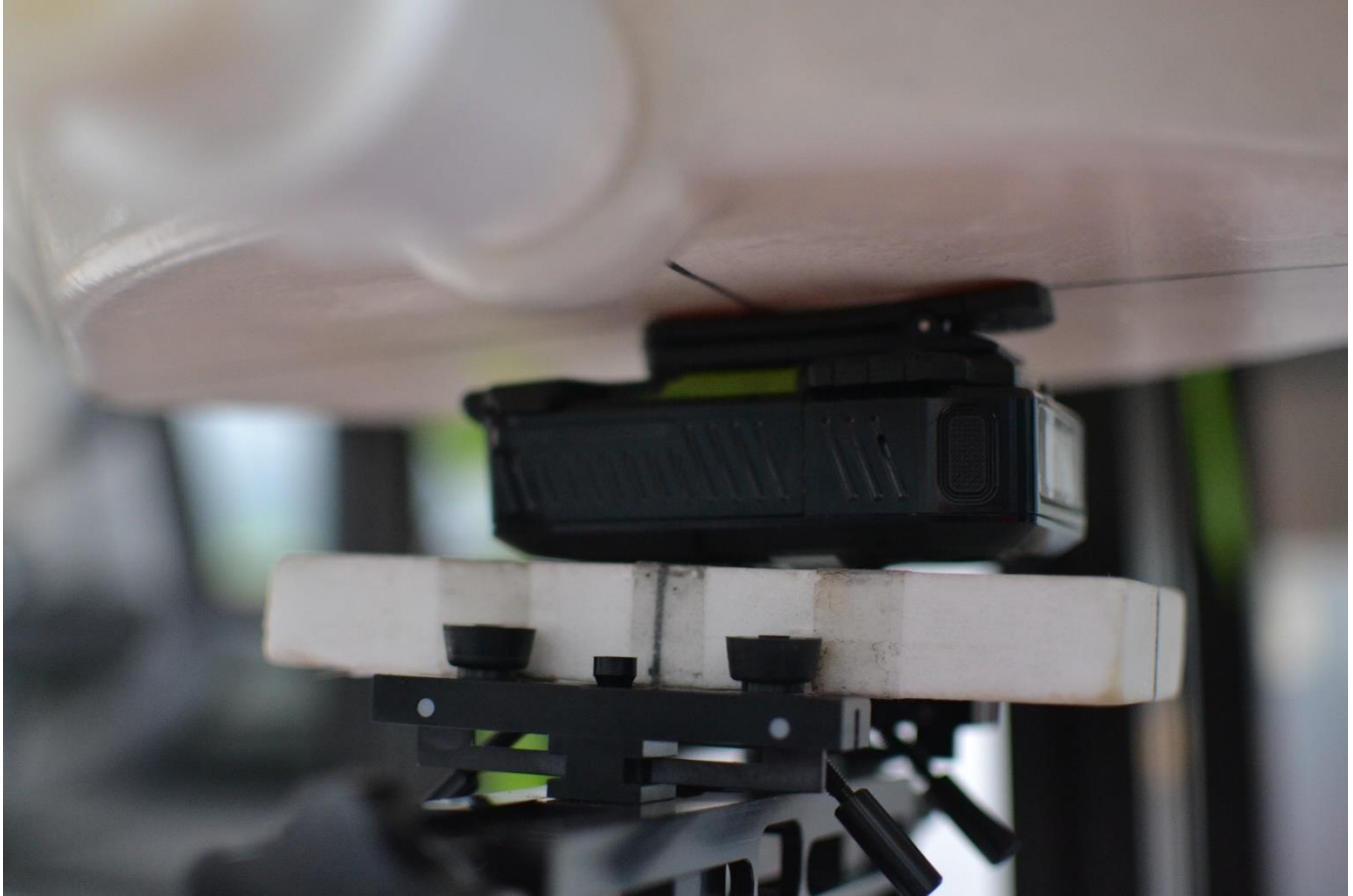
SAR Test Setup Photo 1 – Mount WGP02697B, Back Side at 0mm