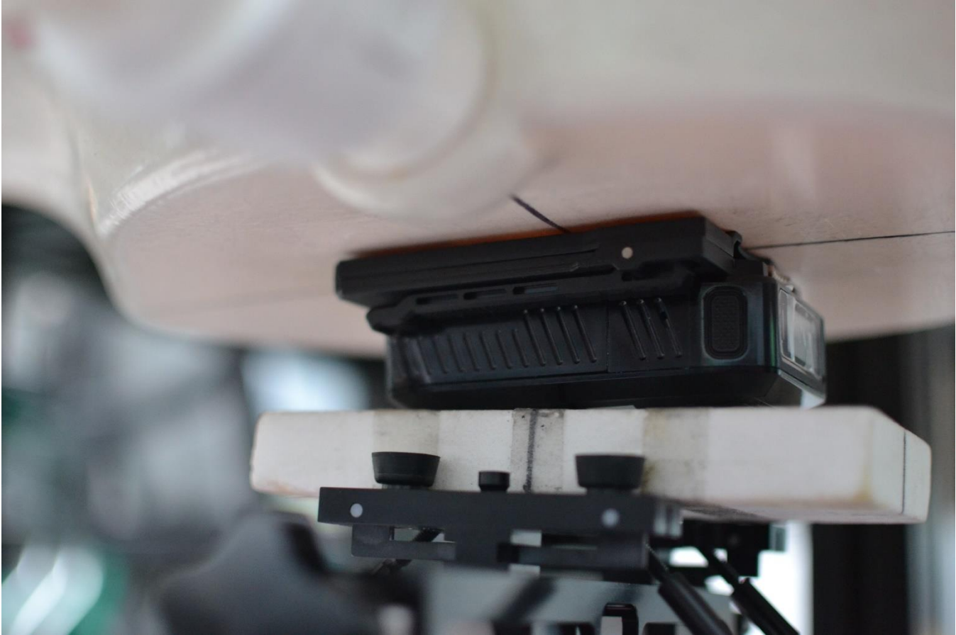
SAR Test Setup Photo 6 – Mount WGP02798C, Back Side at 0mm