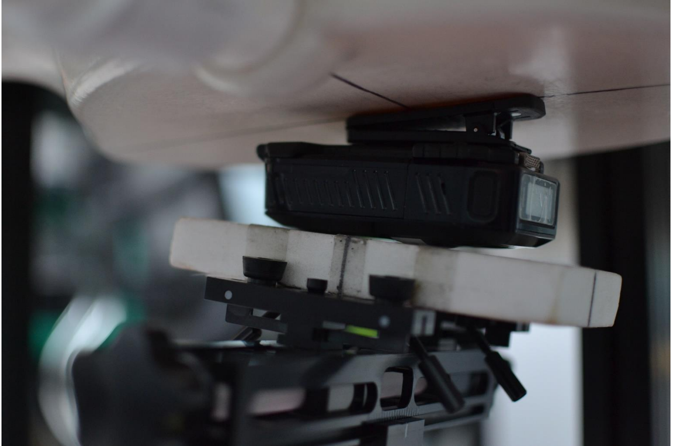
SAR Test Setup Photo 2 – Mount WGP03088, Back Side at 0mm