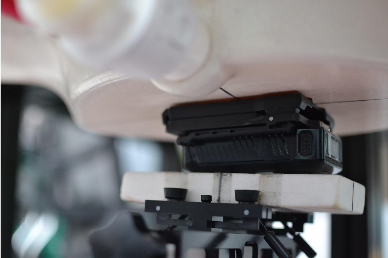
SAR Test Setup Photo 5 – Mount WGP03085, Back Side at 0mm