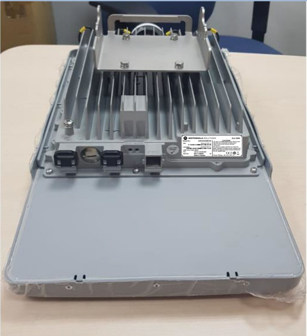
Bottom View with Label Placement Location