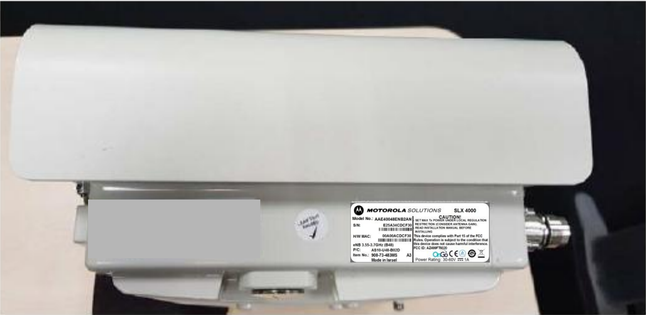
Side View – with label placement location