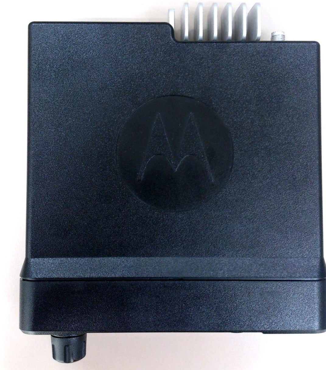
Top View (Same for XPR 5580e Color Display and XPR 5380e Numeric Display)