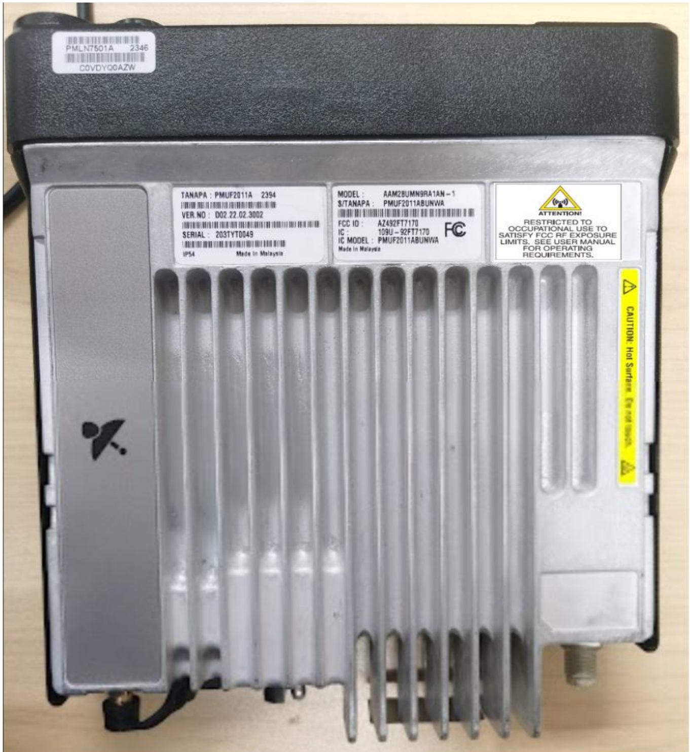
Bottom View (FCC/IC Label Location) (Same for XPR 5580e Color Display and XPR 5380e Numeric Display)