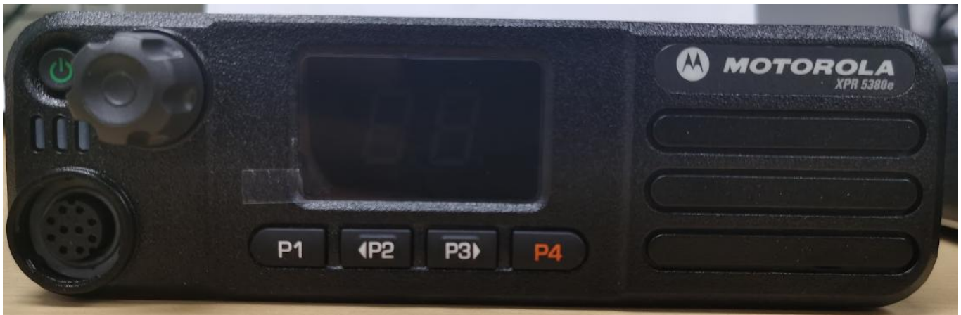
Front View (XPR 5380e - Numeric Display)