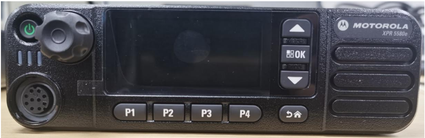
Front View (XPR 5580e - Color Display)