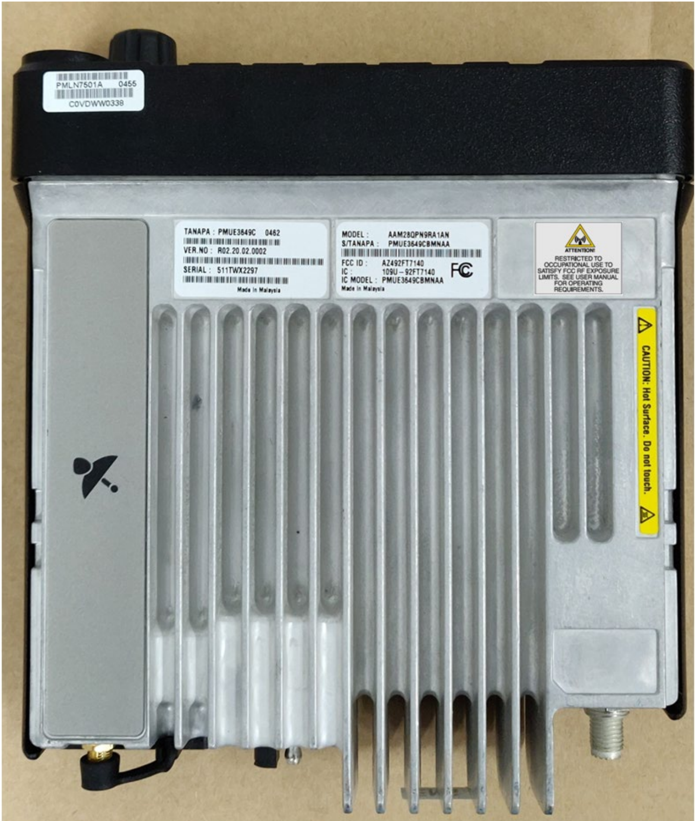
Bottom View (FCC/IC Label Location) Same for XPR 5550e Color Display and XPR 5350e Numeric Display