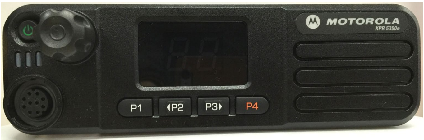
Front View (XPR 5350e - Numeric Display)