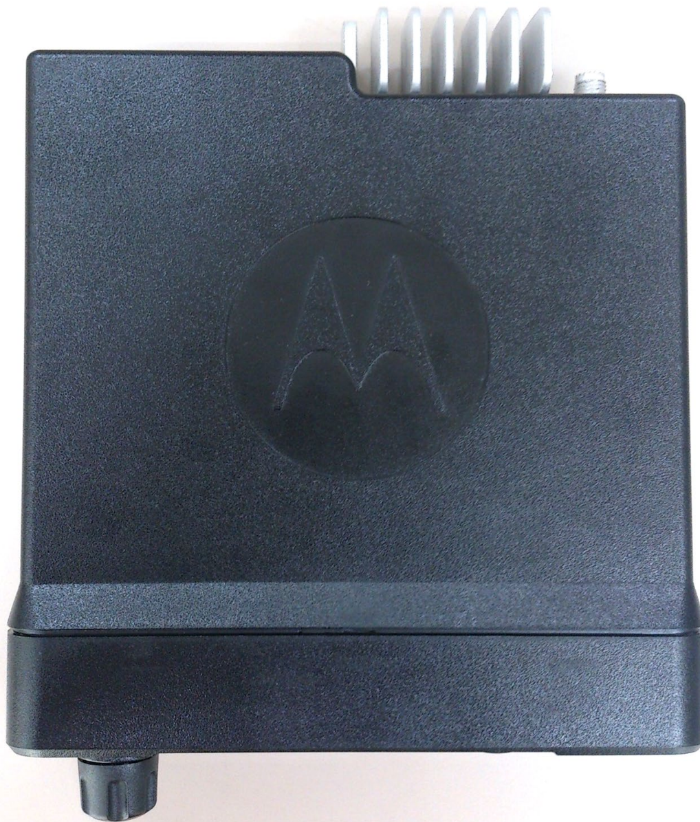
Top View (Same for XPR 5550e Color Display and XPR 5350e Numeric Display)