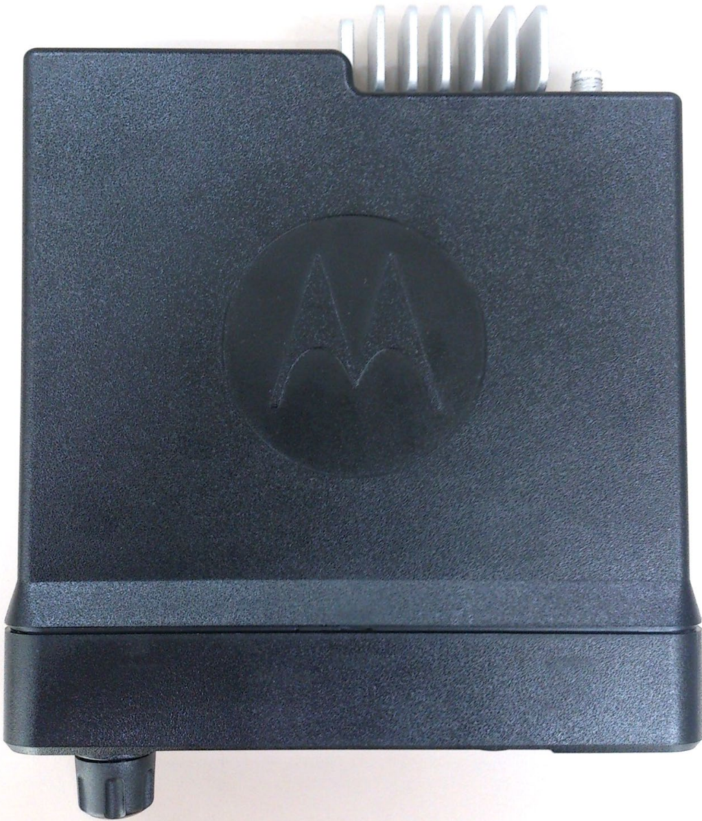
Top View (Same for XPR 5550e Color Display and XPR 5350e Numeric Display)