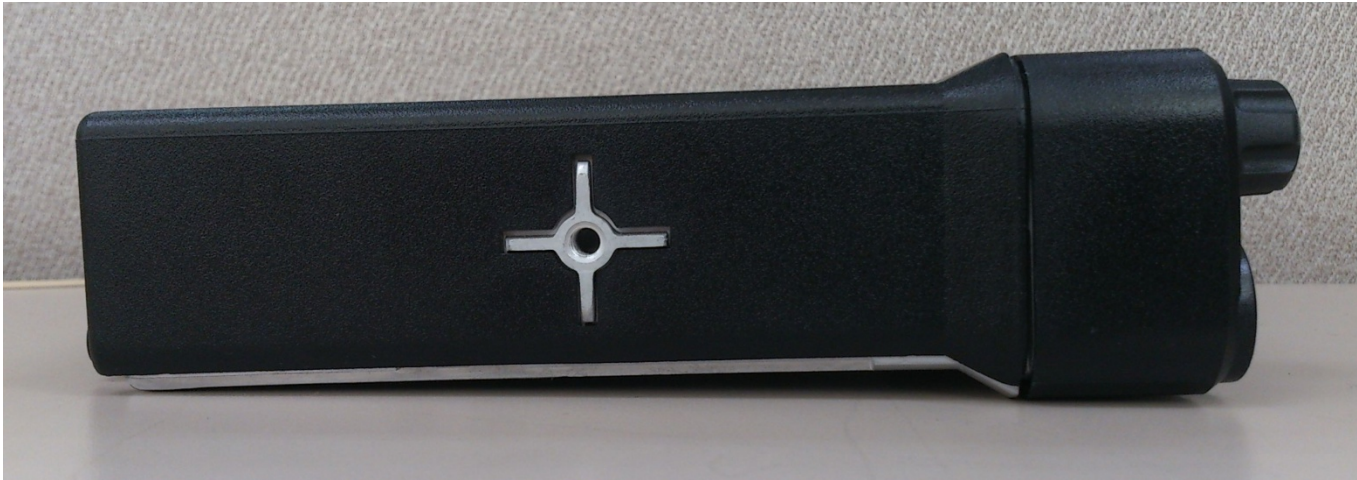
Side View (Left) – Same for XPR 5550e Color Display and XPR 5350e Numeric Display