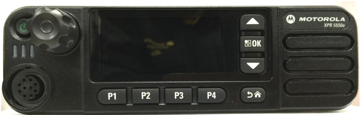
Front View (XPR 5550e - Color Display)