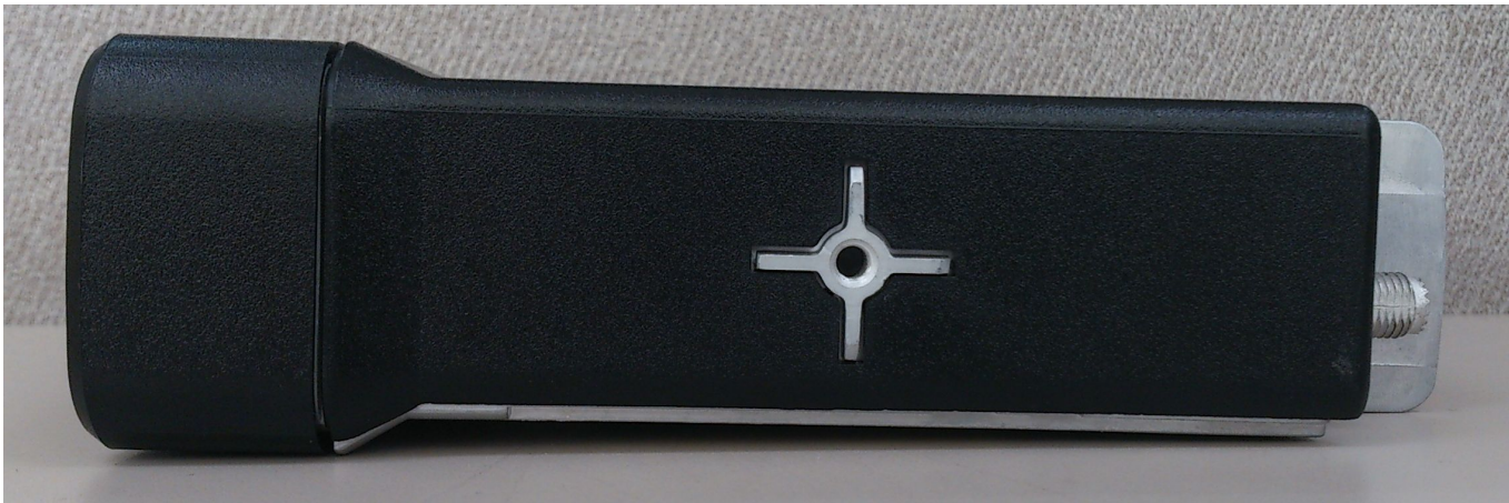
Side View (Right) – Same for XPR 5550e Color Display and XPR 5350e Numeric Display