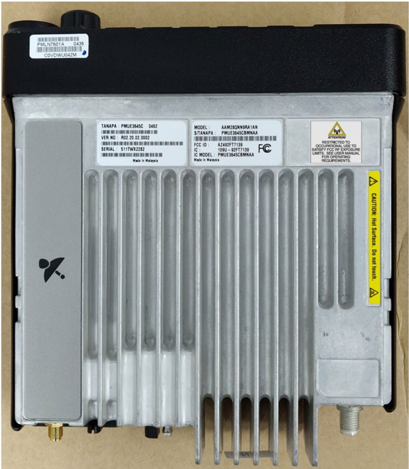
Bottom View (FCC/IC Label Location) Same for XPR 5550e Color Display and XPR 5350e Numeric Display