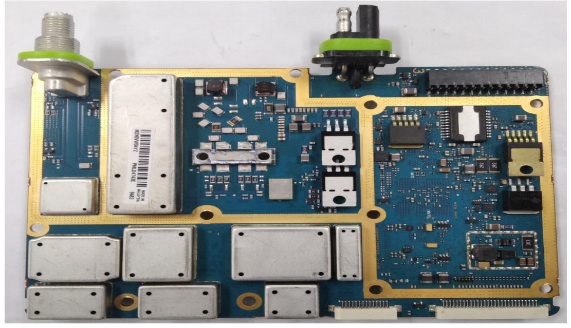
RF board with Shields (Top)