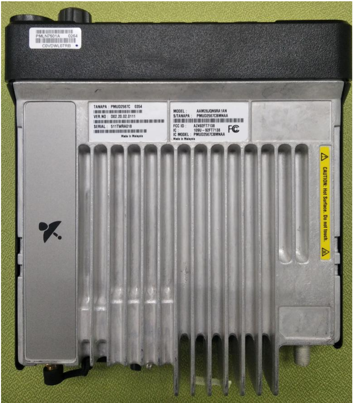
Bottom view (FCC Label Location) for Color display and Numeric display- XPR 5550e & XPR 5350e