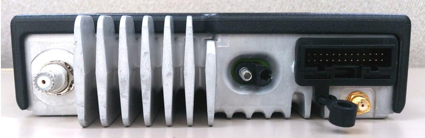
Back view for Color display and Numeric display- XPR 5550e & XPR 5350e