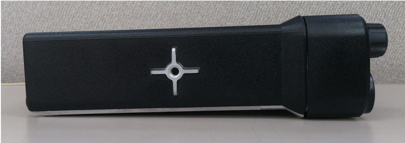
Side view (Left) for Color display and Numeric display- XPR 5550e & XPR 5350e