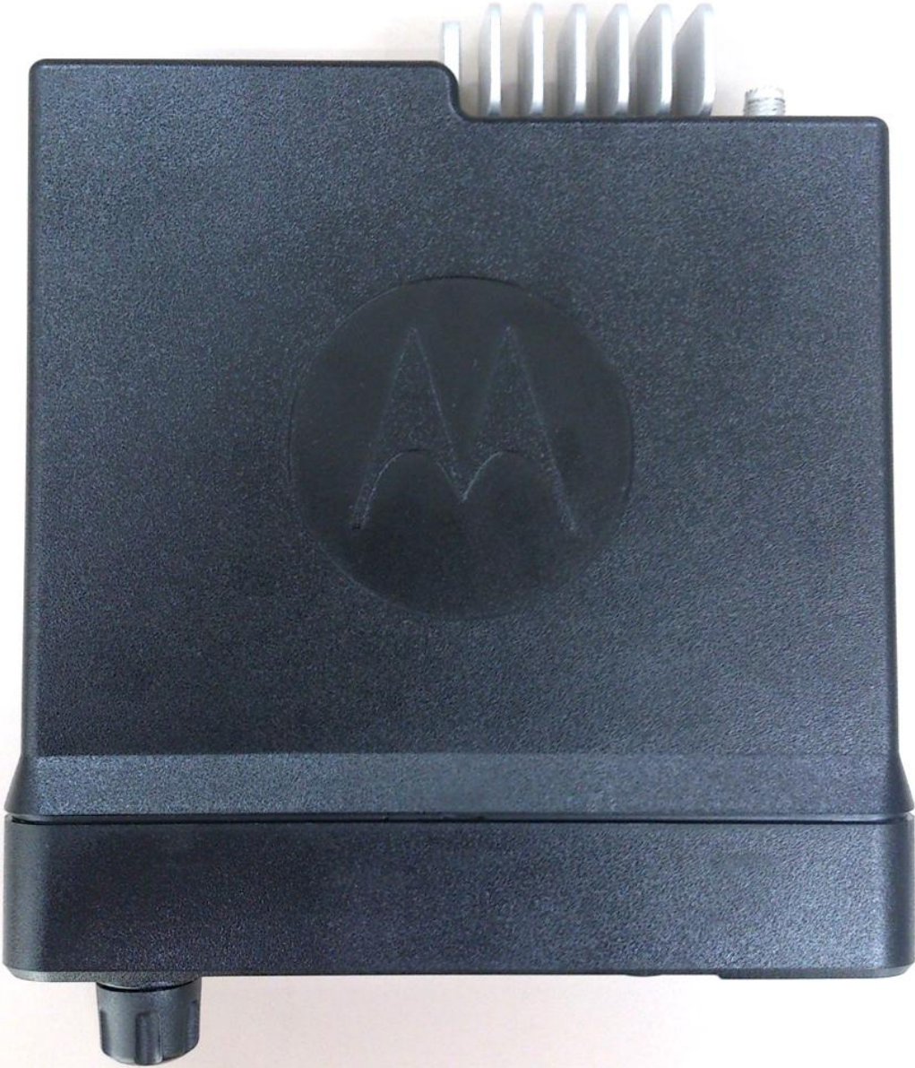
Top view for Color display and Numeric display- XPR 5550e & XPR 5350e