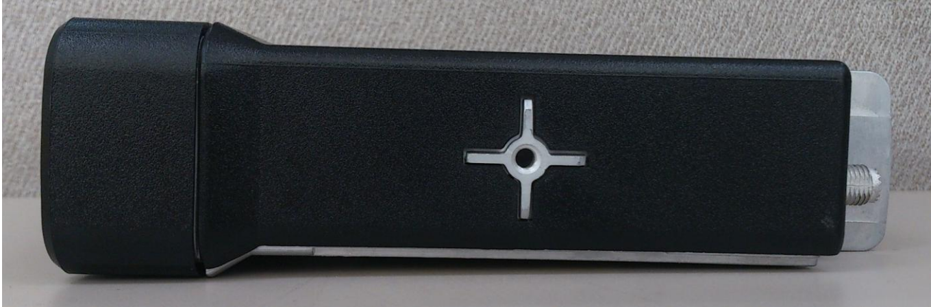
Side view (Right) for Color display and Numeric display- XPR 5550e & XPR 5350e