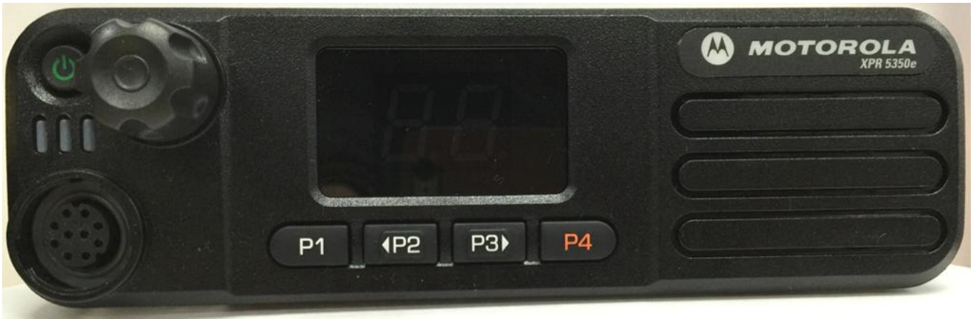
XPR 5350e Front view (Numeric display)