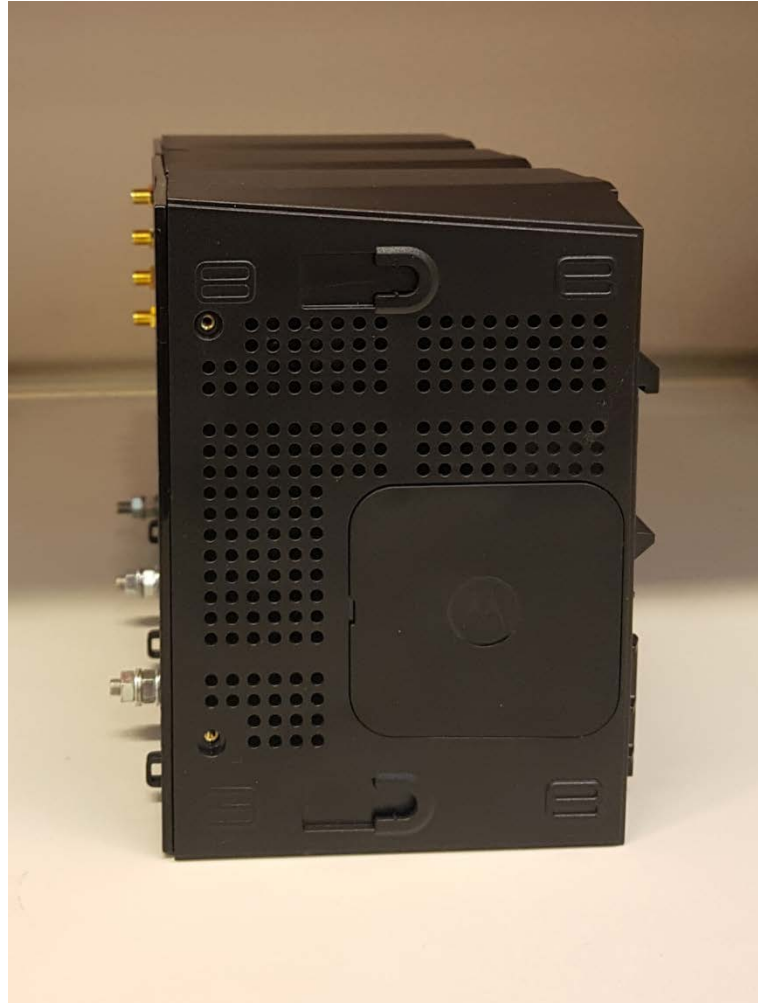
Side View (Right)