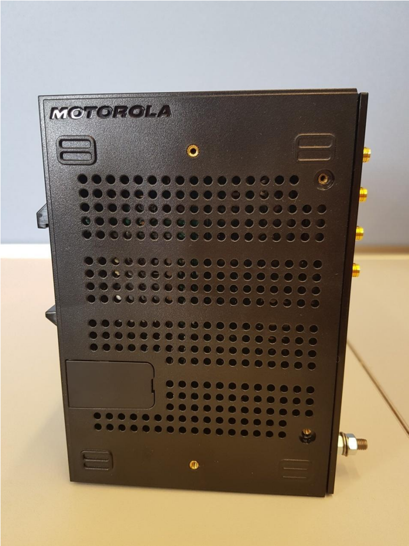
Side View (Left)