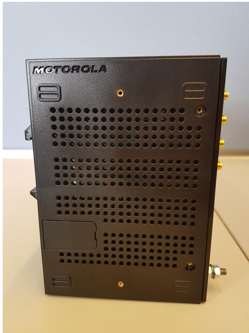
Side View (Left)