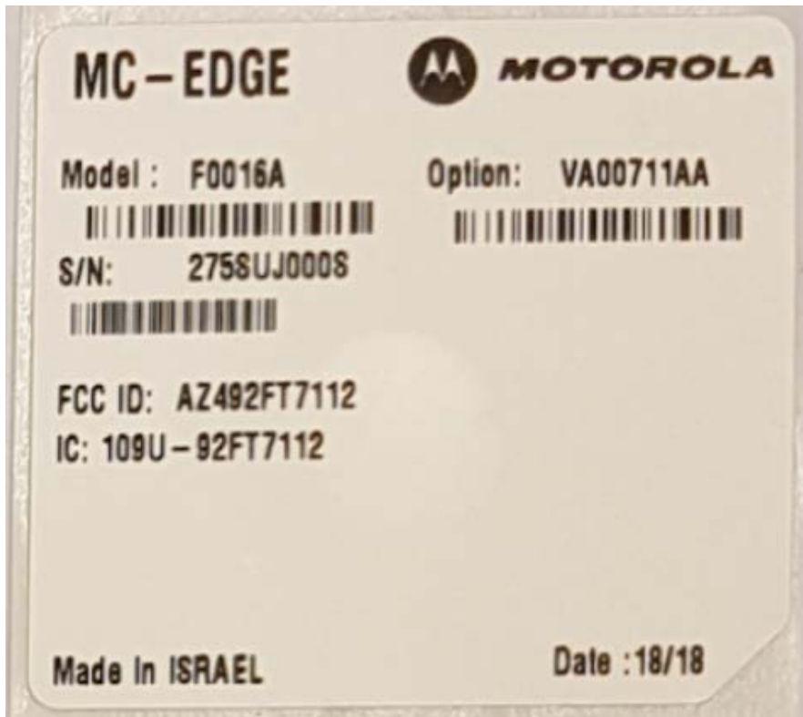
EXHIBIT 1A - FCC/IC Label for APX4000 VHF for MC-EDGE