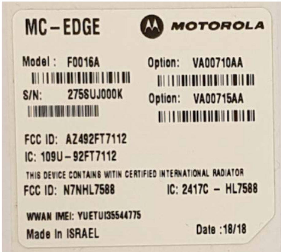
EXHIBIT 1B - FCC/IC Label for APX4000 VHF for MC-EDGE with LTE options