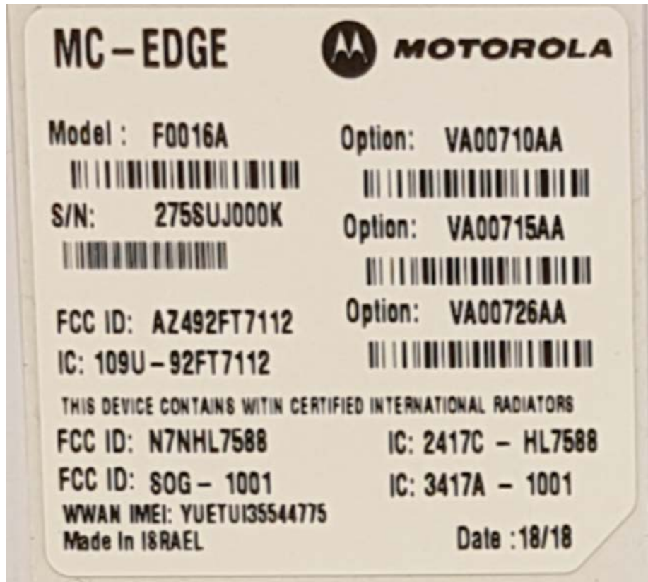
EXHIBIT 1D - FCC/IC Label for APX4000 VHF for MC-EDGE with LTE and LoRA Options