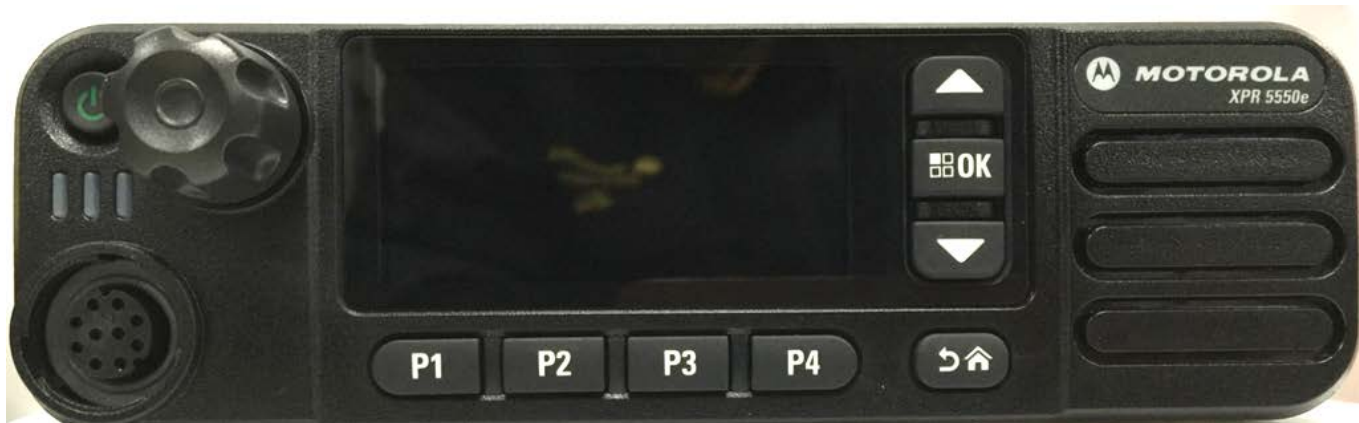
Front view (Color Display)