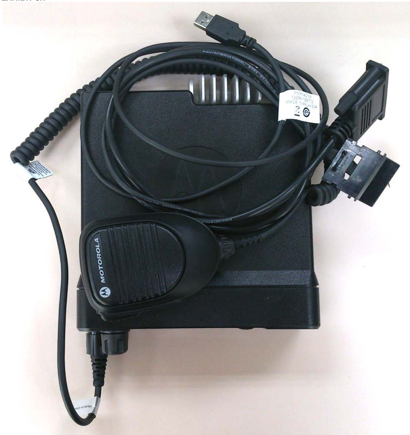
Top view with microphone and rear accessory cable