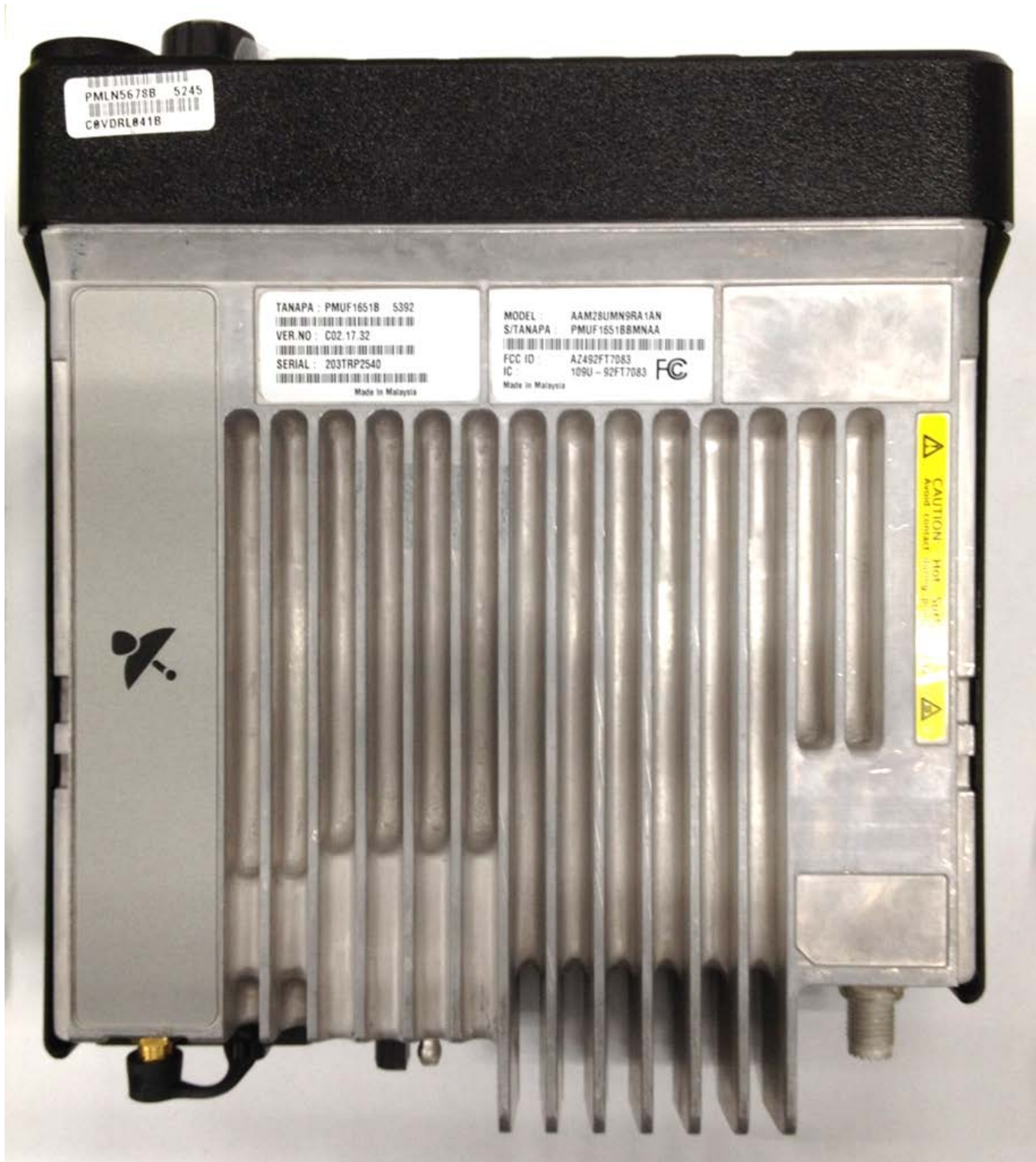
Ex 3D - Bottom view (FCC Label Location)