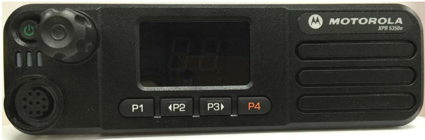
Front view (Numeric Display)