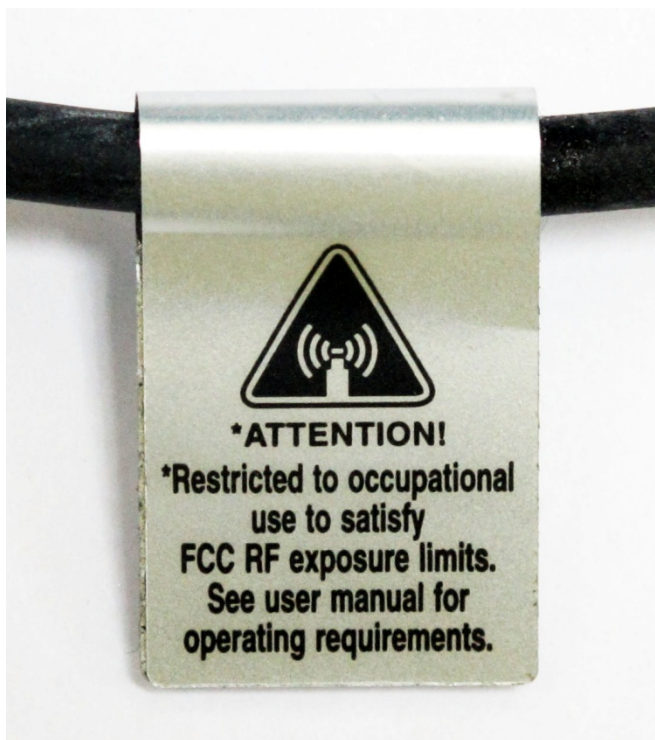
RF Exposure Label (Close View)