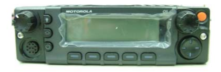
Front view (Controls)