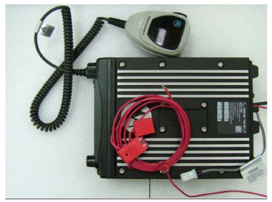
TOP VIEW WITH MICROPHONE AND REAR ACCESSORY CABLE