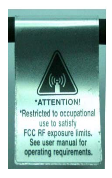
RF Exposure Label (Close View)