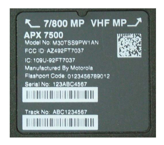
FCC Label (Close View)