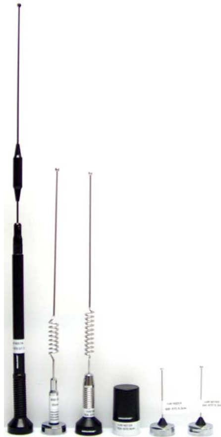
Antenna kit numbers, from left to right; HAF4017A, RRA4914B, HAF4014A, HAF4013A, HAF4002A, HAF4016A