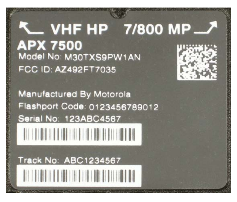
FCC LABEL (CLOSE VIEW)