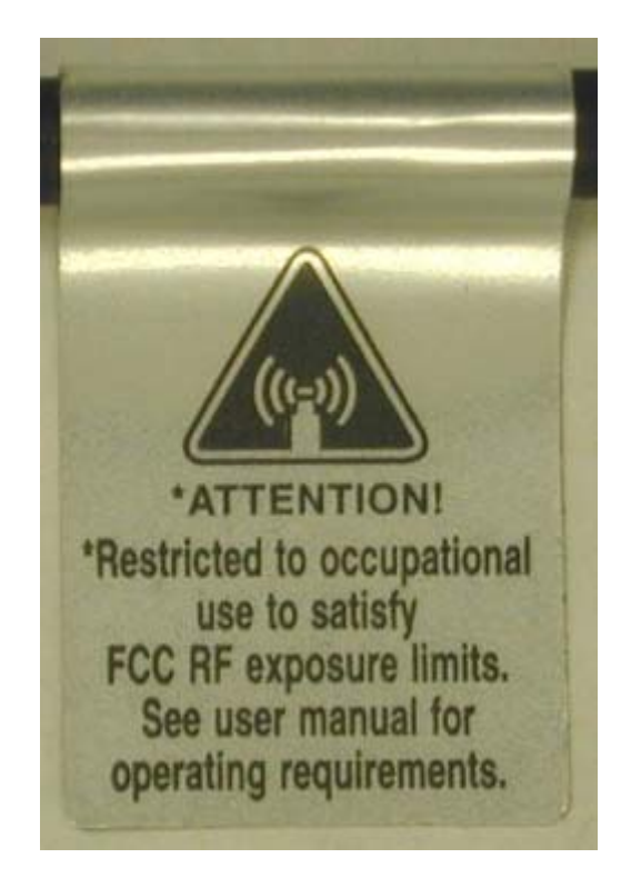
RF EXPOSURE LABEL (CLOSE VIEW)