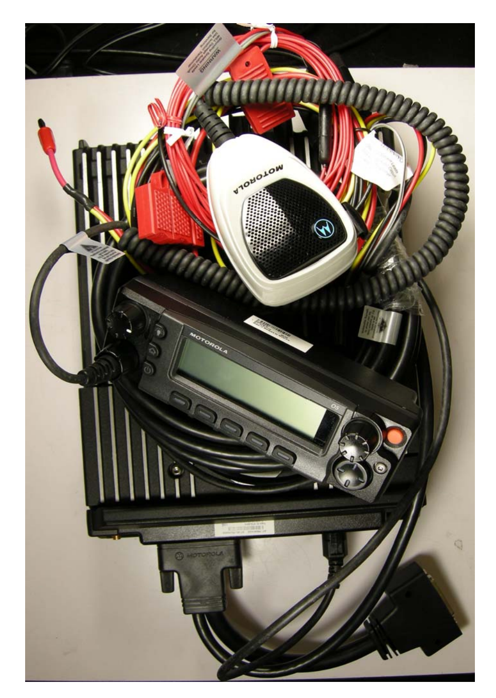
TOP VIEW WITH MICROPHONE, CONTROL HEAD AND CABLES