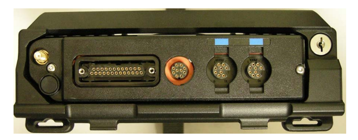
FRONT VIEW (CONTROLS)