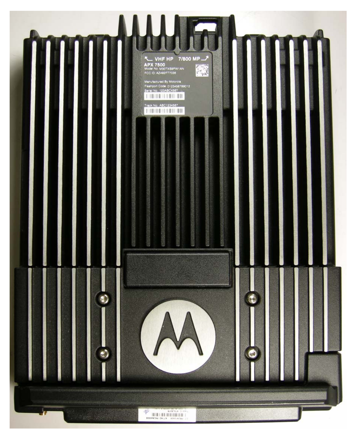
TOP VIEW (FCC LABEL LOCATION)