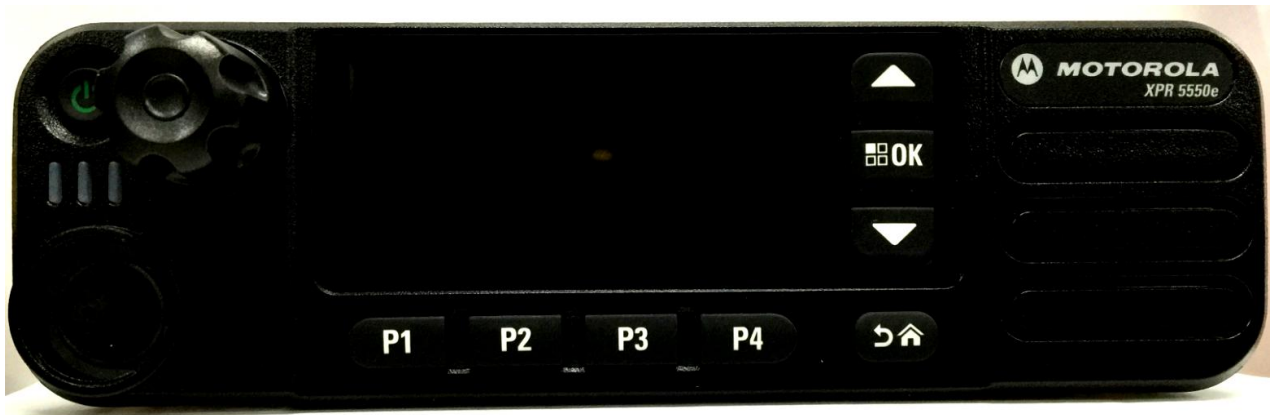
Front View (XPR 5550e - Color Display)