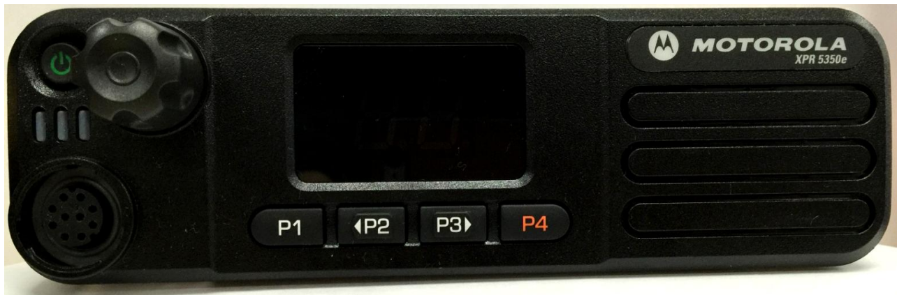
Front View (XPR 5350e - Numeric Display)