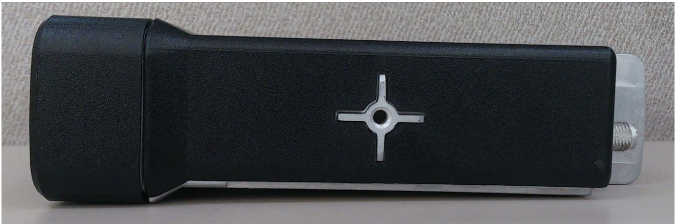
Side View (Right) – Same for XPR 5550e Color Display and XPR 5350e Numeric Display