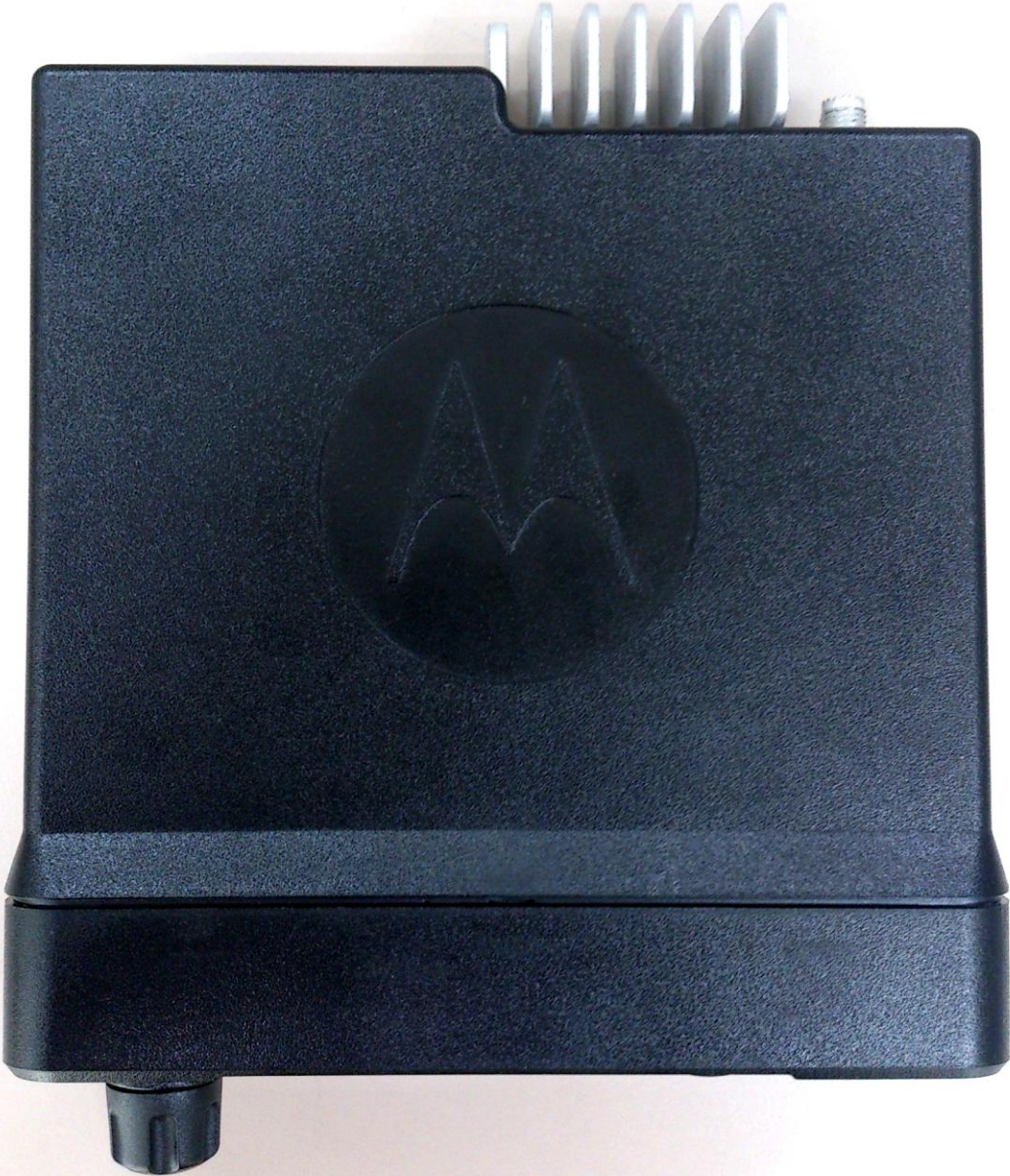
Top View (Same for XPR 5550e Color Display and XPR 5350e Numeric Display)