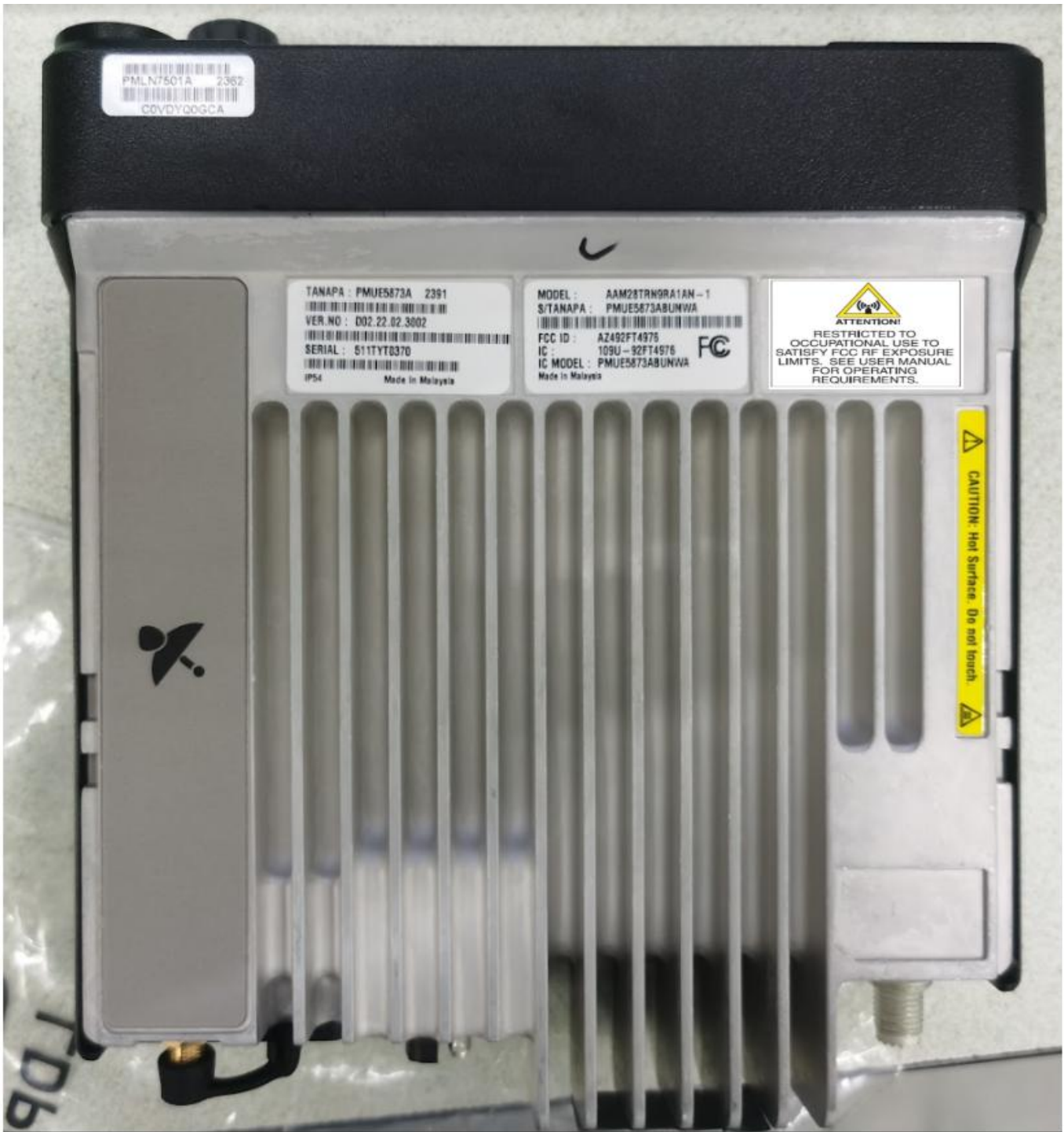
Bottom View (FCC/IC Label Location) Same for XPR 5550e Color Display and XPR 5350e Numeric Display