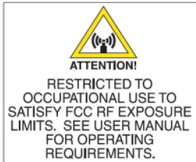
Figure 4: Occupational Use Label