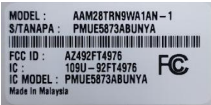
Figure 3: FCC and IC Label for XPR 5550e 450-512M 40W GOB GNSS CFS Color Display