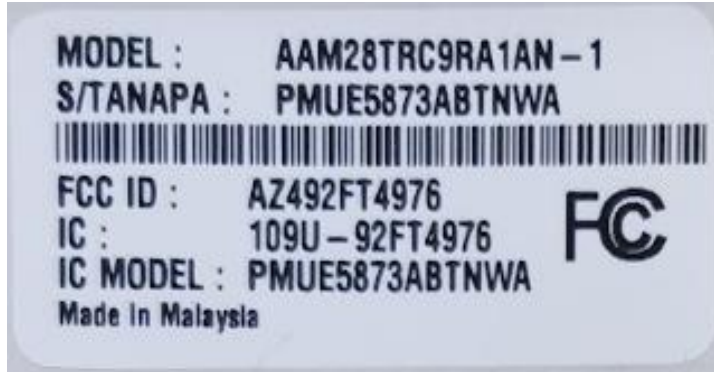
Figure 1: FCC and IC Label for XPR 5350e 450-512M 40W GOB GNSS Numeric Display