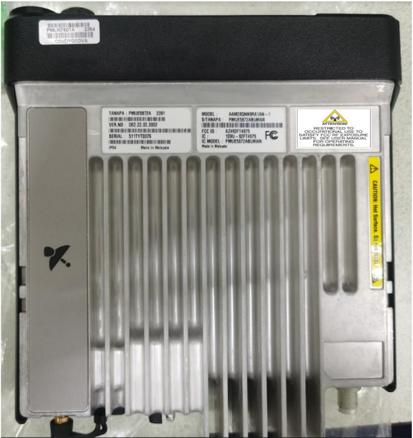
Bottom View (FCC/IC Label Location) Same for XPR 5550e Color Display and XPR 5350e Numeric Display