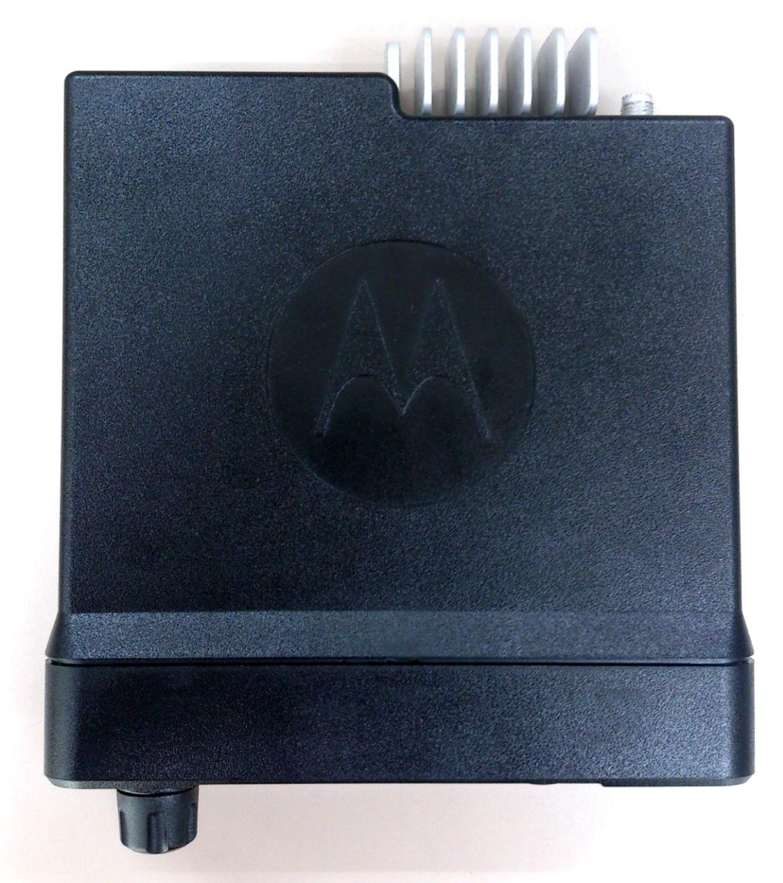
Top View (Same for XPR 5550e Color Display and XPR 5350e Numeric Display)