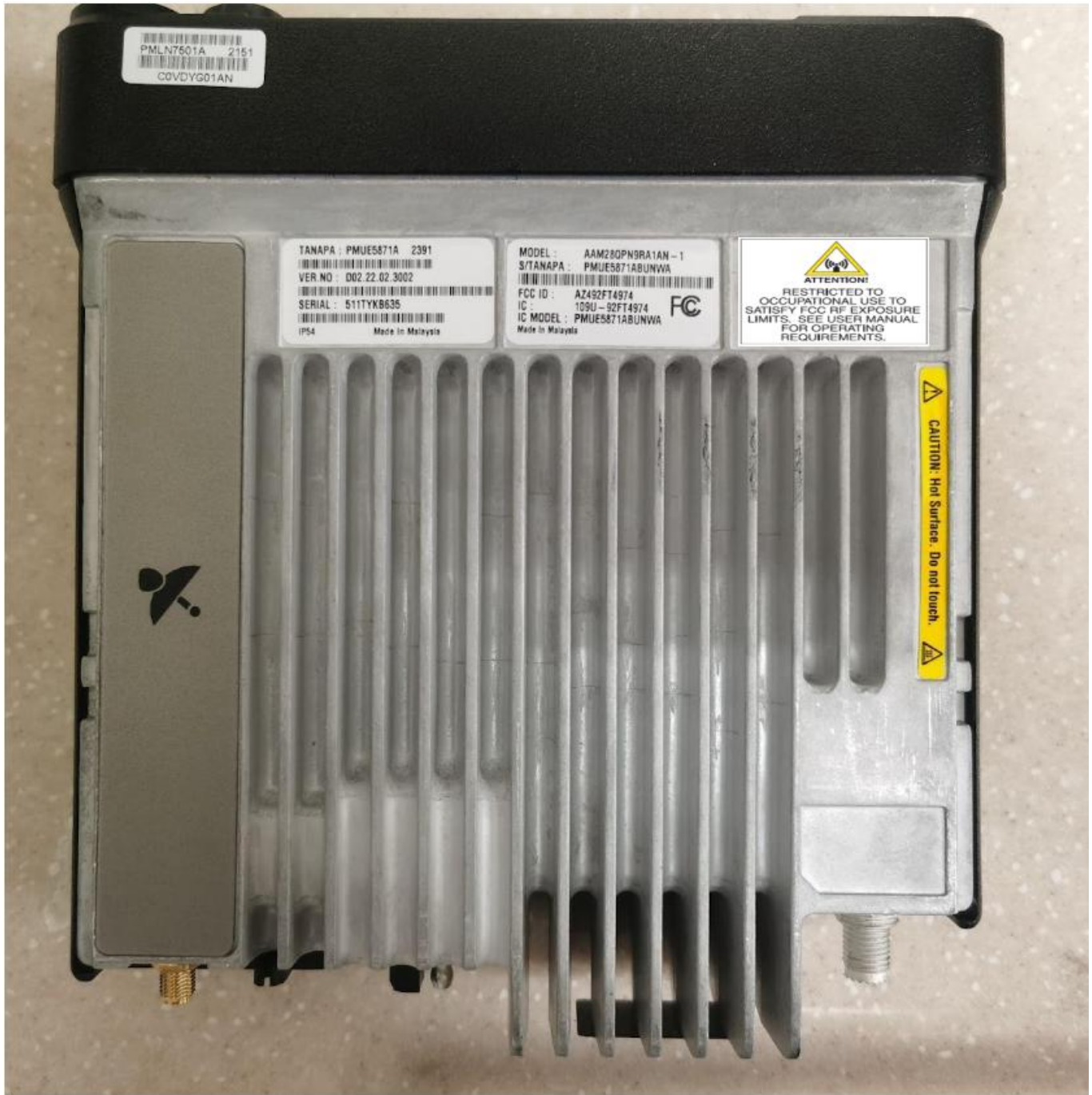
Bottom View (FCC/IC Label Location) Same for XPR 5550e Color Display and XPR 5350e Numeric Display