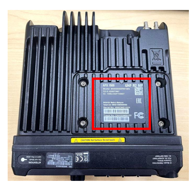
Exhibit 3G: View of FCC/IC Label Location (APX 1500/ APX 2500/ APX4500/ APX 6500/ APX6500Li)