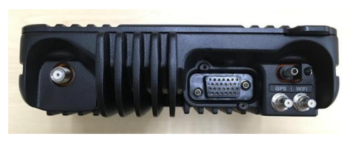
Exhibit 3F: Back view