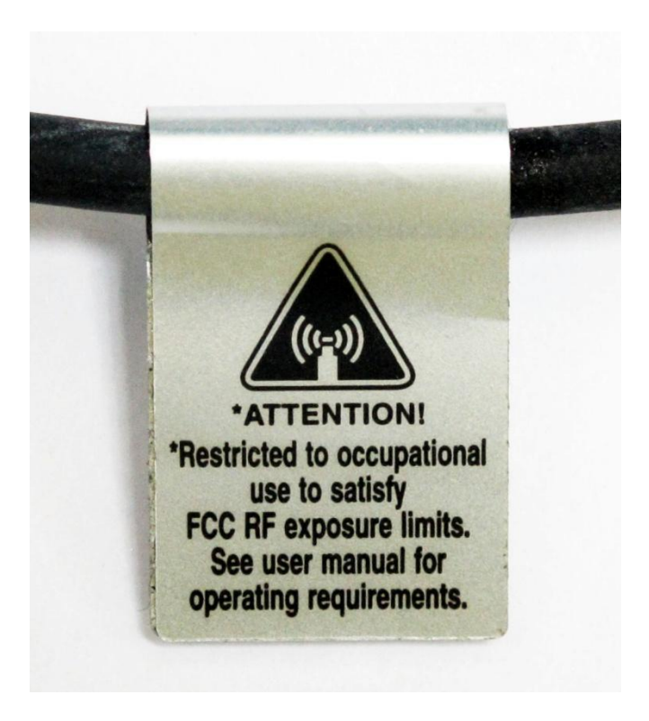
Exhibit 3G: RF Exposure Label (Close View)