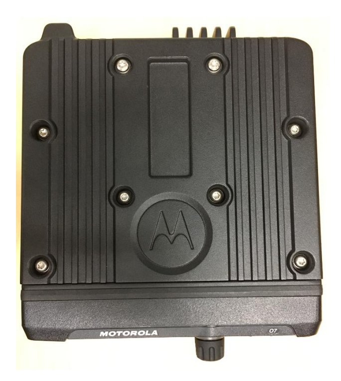
Exhibit 3J: Top view