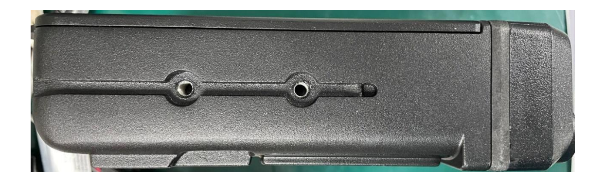
Exhibit 3I: Left view