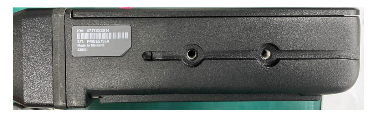
Exhibit 3H: Right view