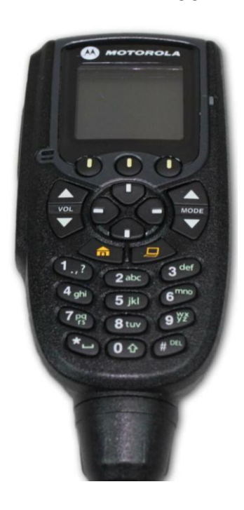
Exhibit 3E: Front view with O3 control head (Hand held)