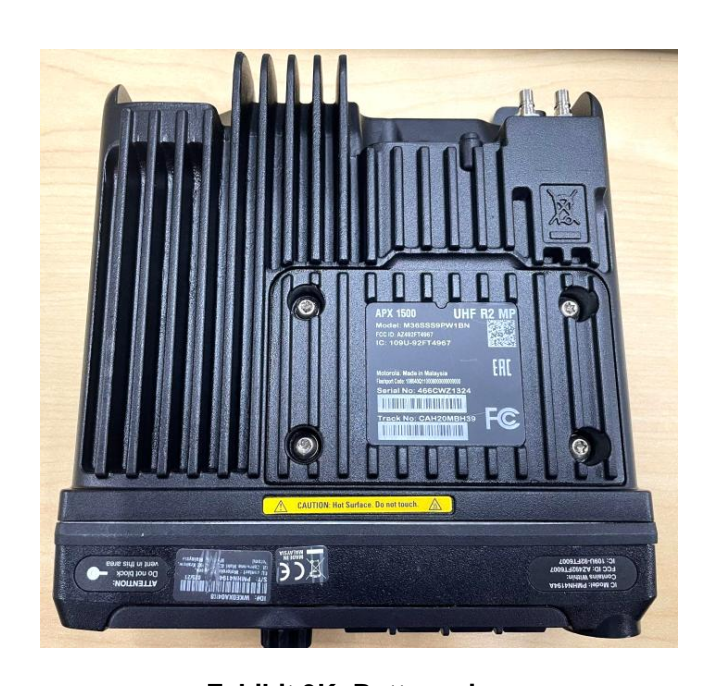
Exhibit 3K: Bottom view