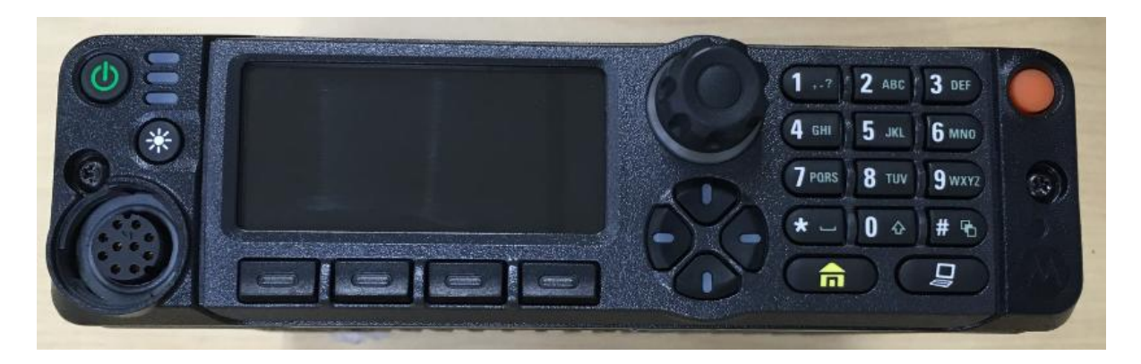
Exhibit 3A: Front view with O7 control head