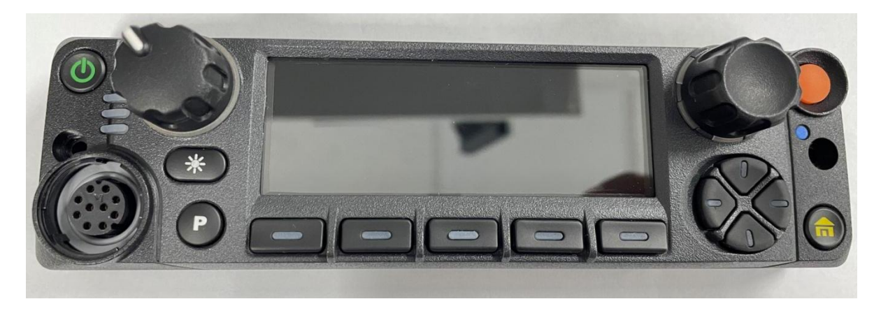
Exhibit 3B: Front view with E5 control head