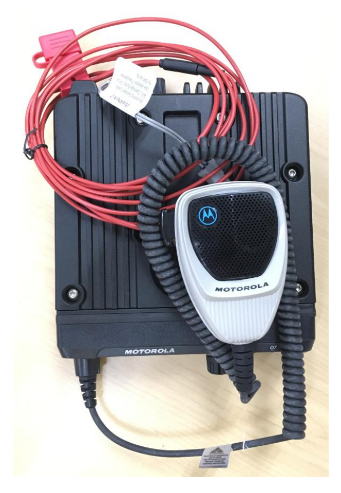
Exhibit 3L: Top view with microphone and rear accessory cable