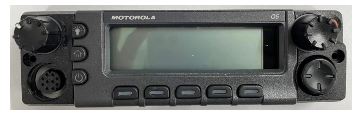
Exhibit 3D: Front view with O5 control head